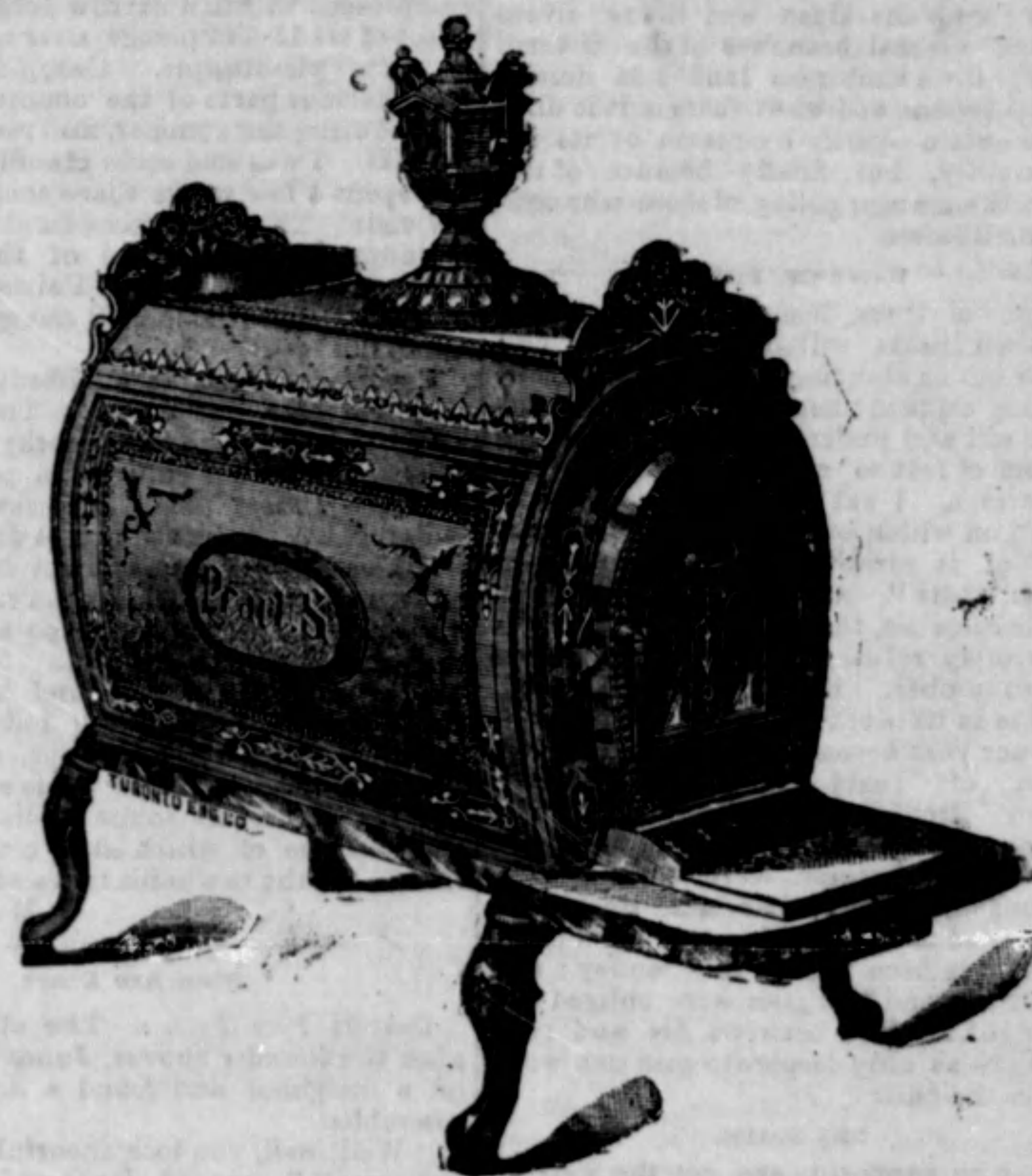
Why buy a box stove when you can get a parlor stove as cheap.