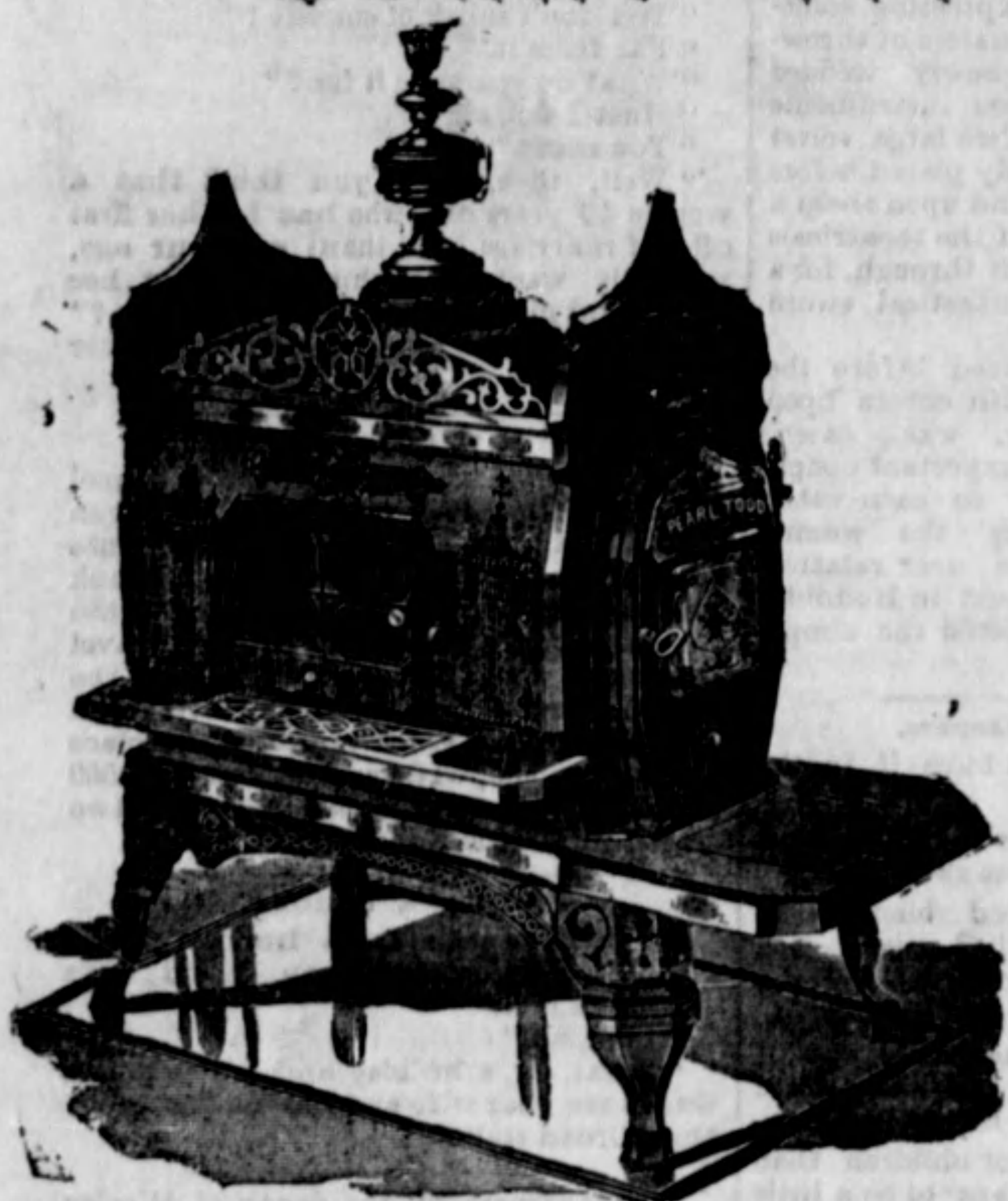
The cheapest Stoves for the weight and style we make.

T. L. Moffat & Sons, MANUFACTURERS, MARK DALE, Ont.