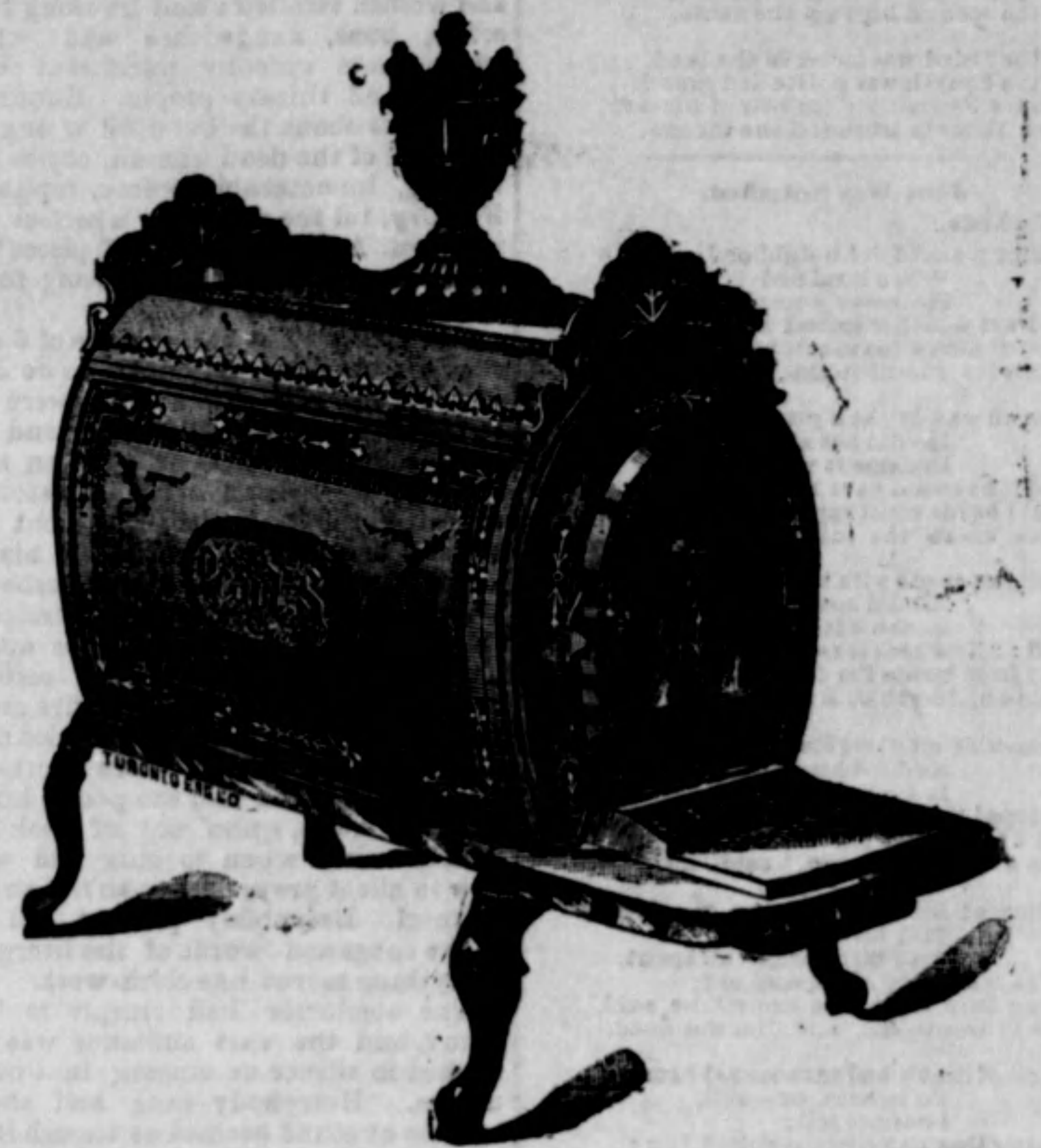
Why buy a box stove when you can get a parlor stove as cheap.