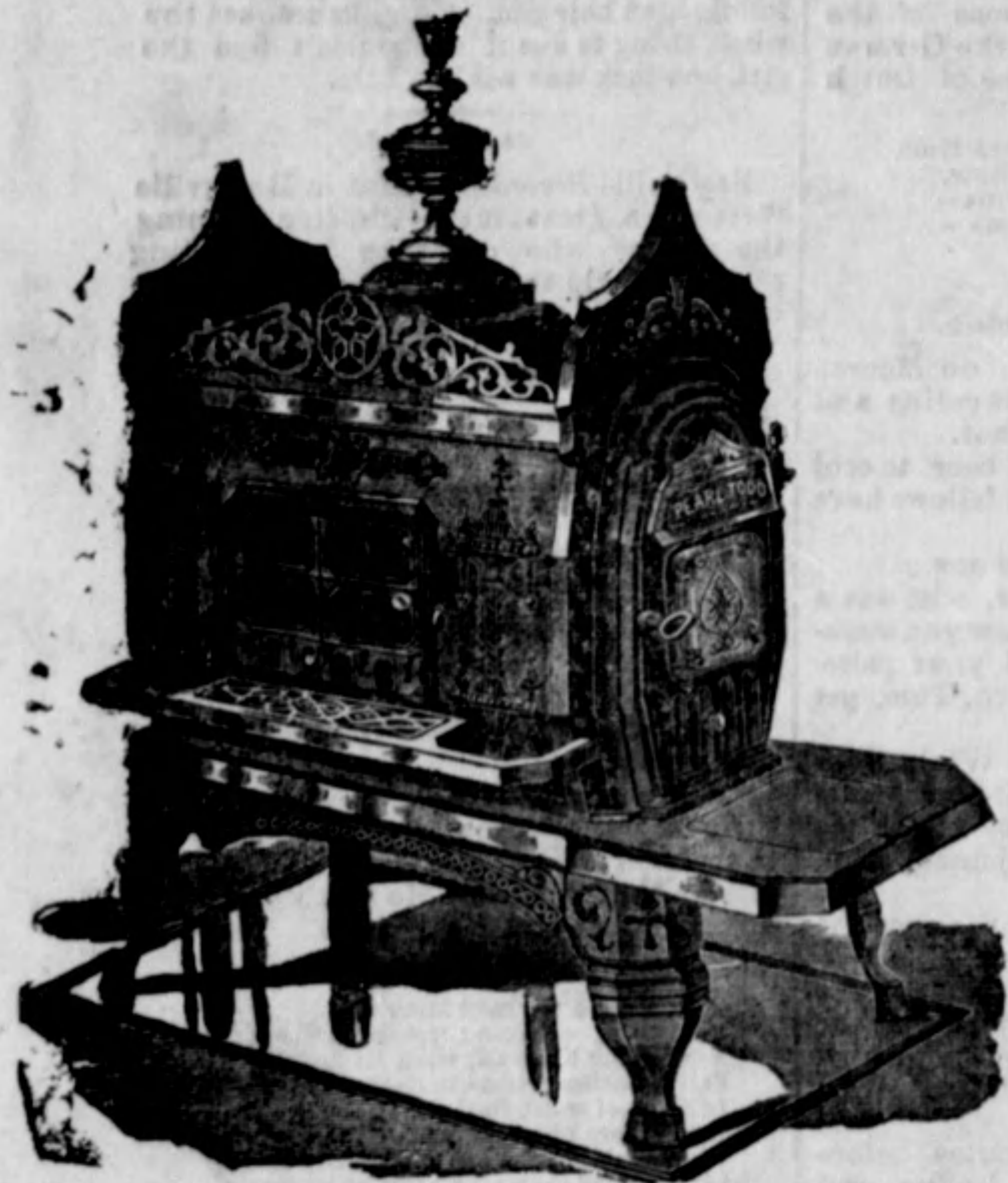
The cheapest Stoves for the weight and style we make.

T. L. Moffat & Sons, MANUFACTURERS, MARKDALE, Ont.