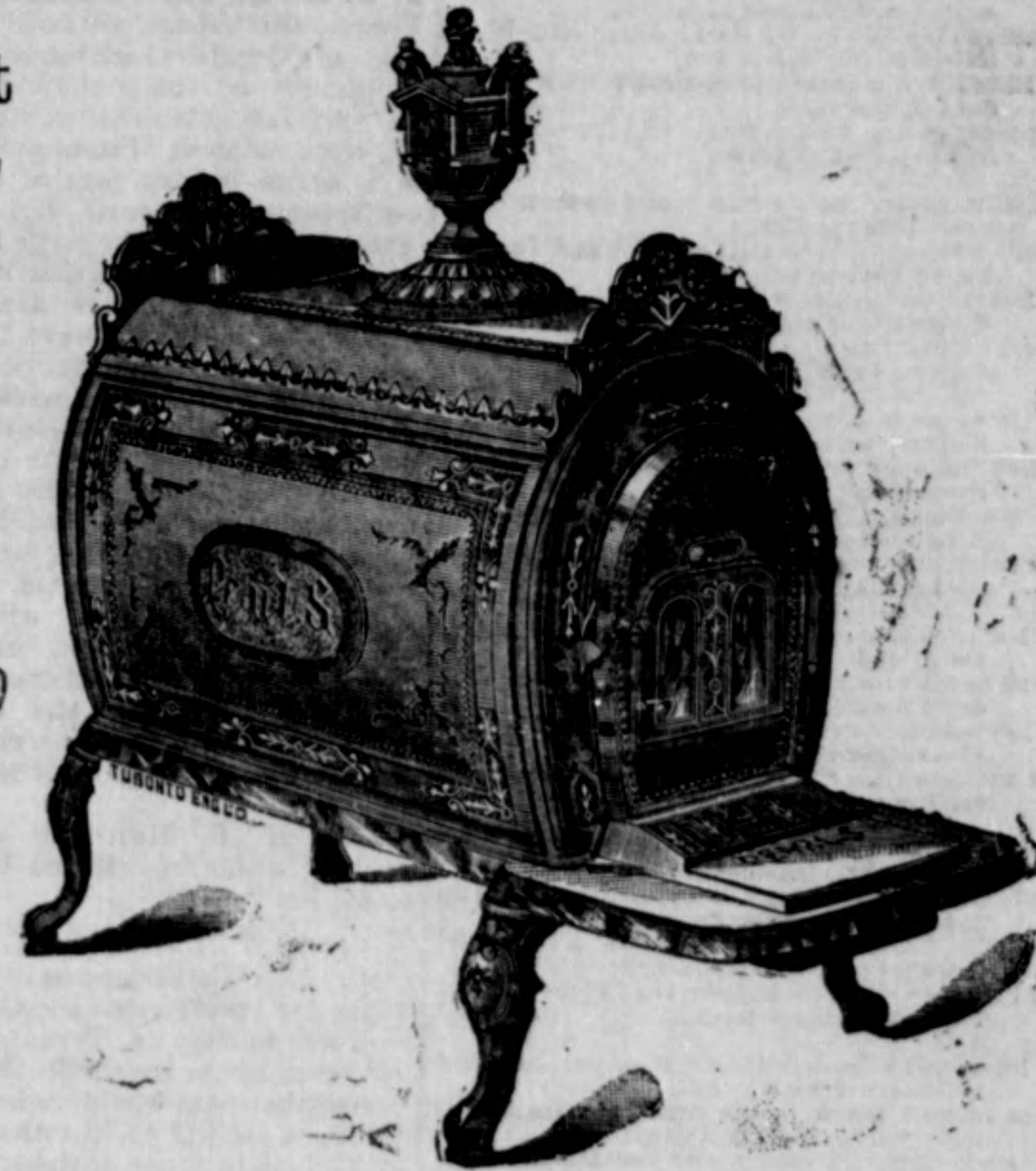
Why buy a box stove when you can get a darning stove as cheap