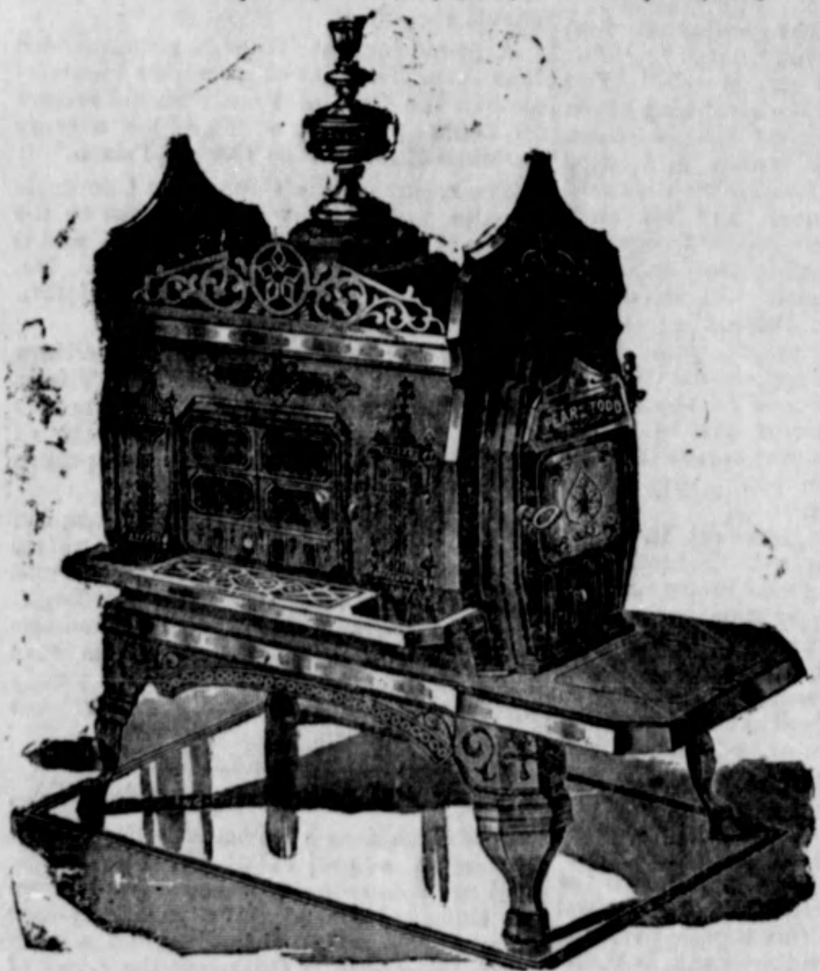
The cheapest Stoves for the weight and style we make.

household reputation throughout Ontario. If your dealer does not keep them write or call on the manufacturers.