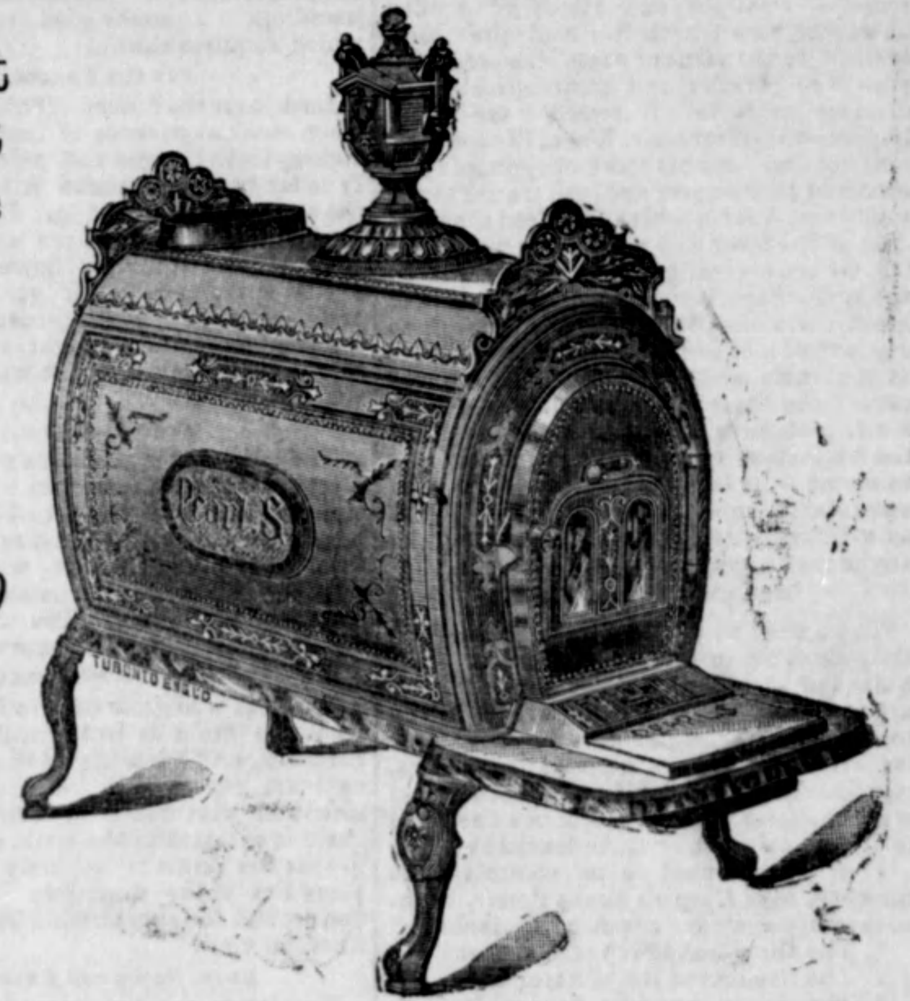
Why buy a box stove when you can get a parlor stove as cheap