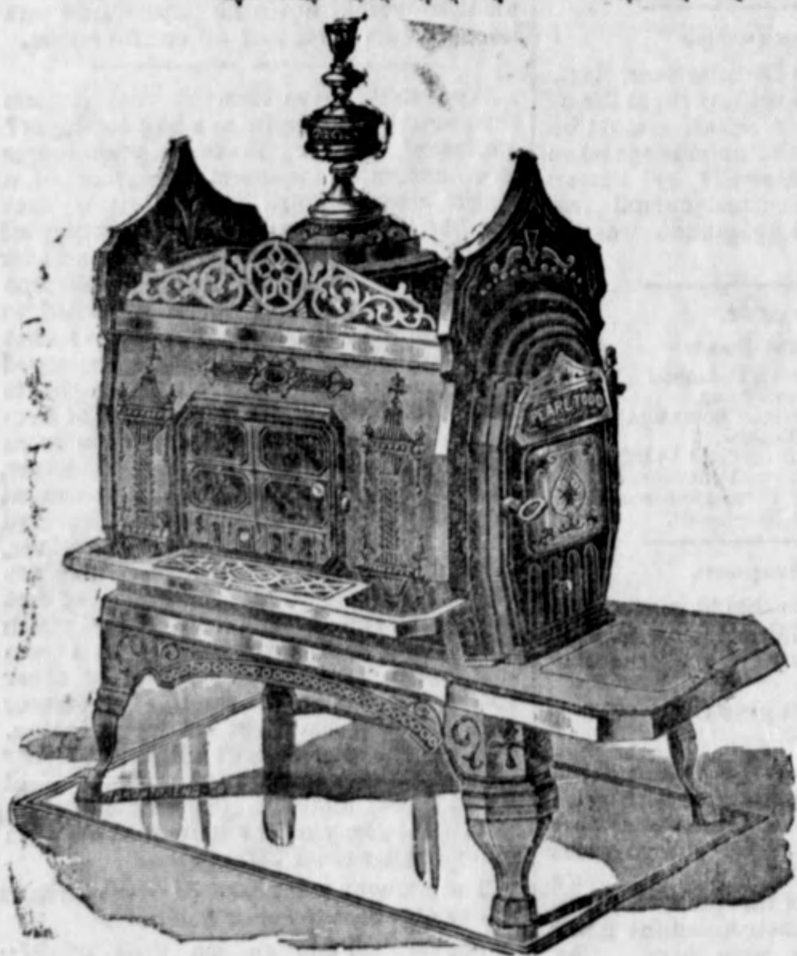
The cheapest Stoves for the weight and style we make.