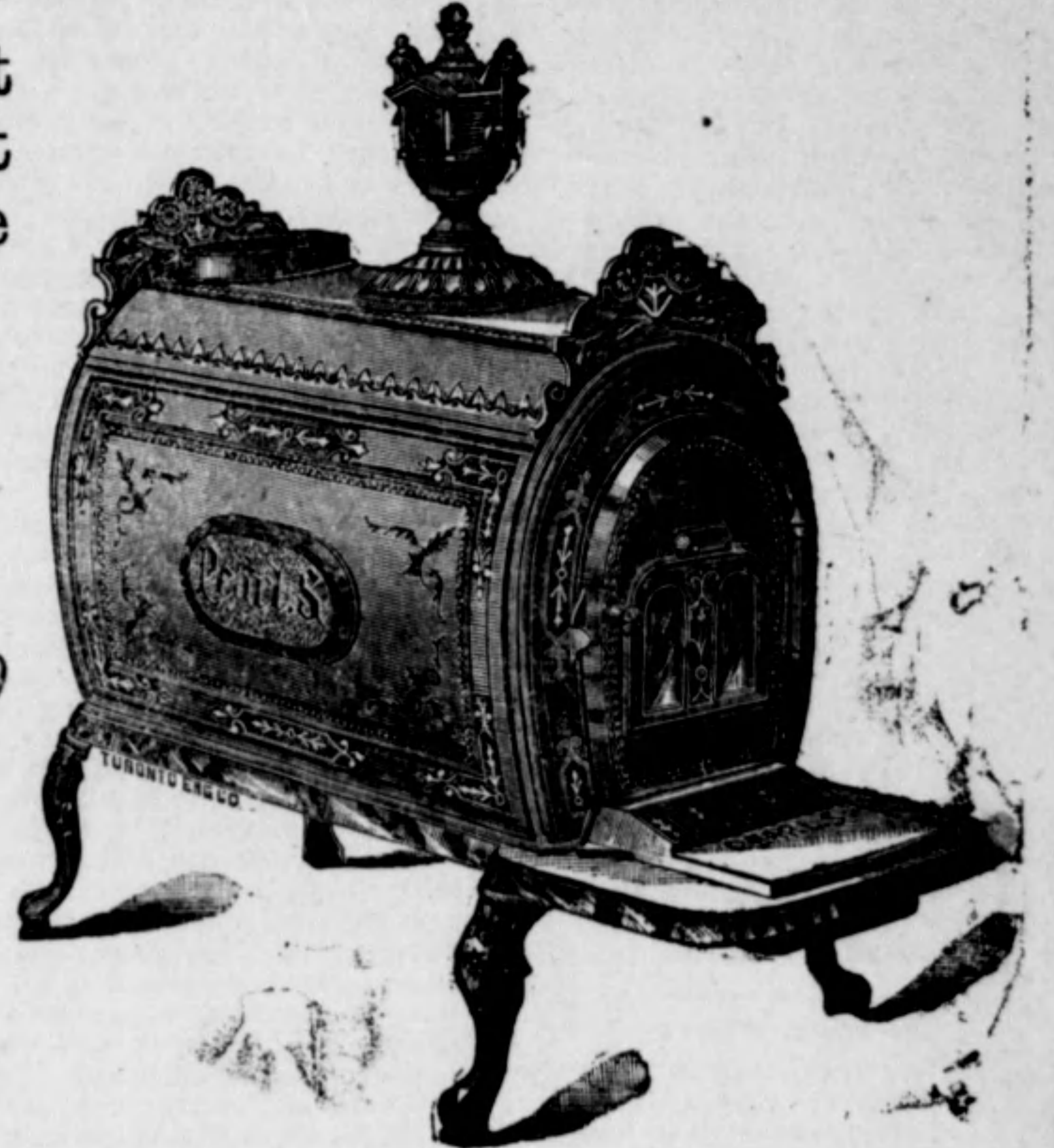
Why buy a box stove when you can get a parlor stove as cheap