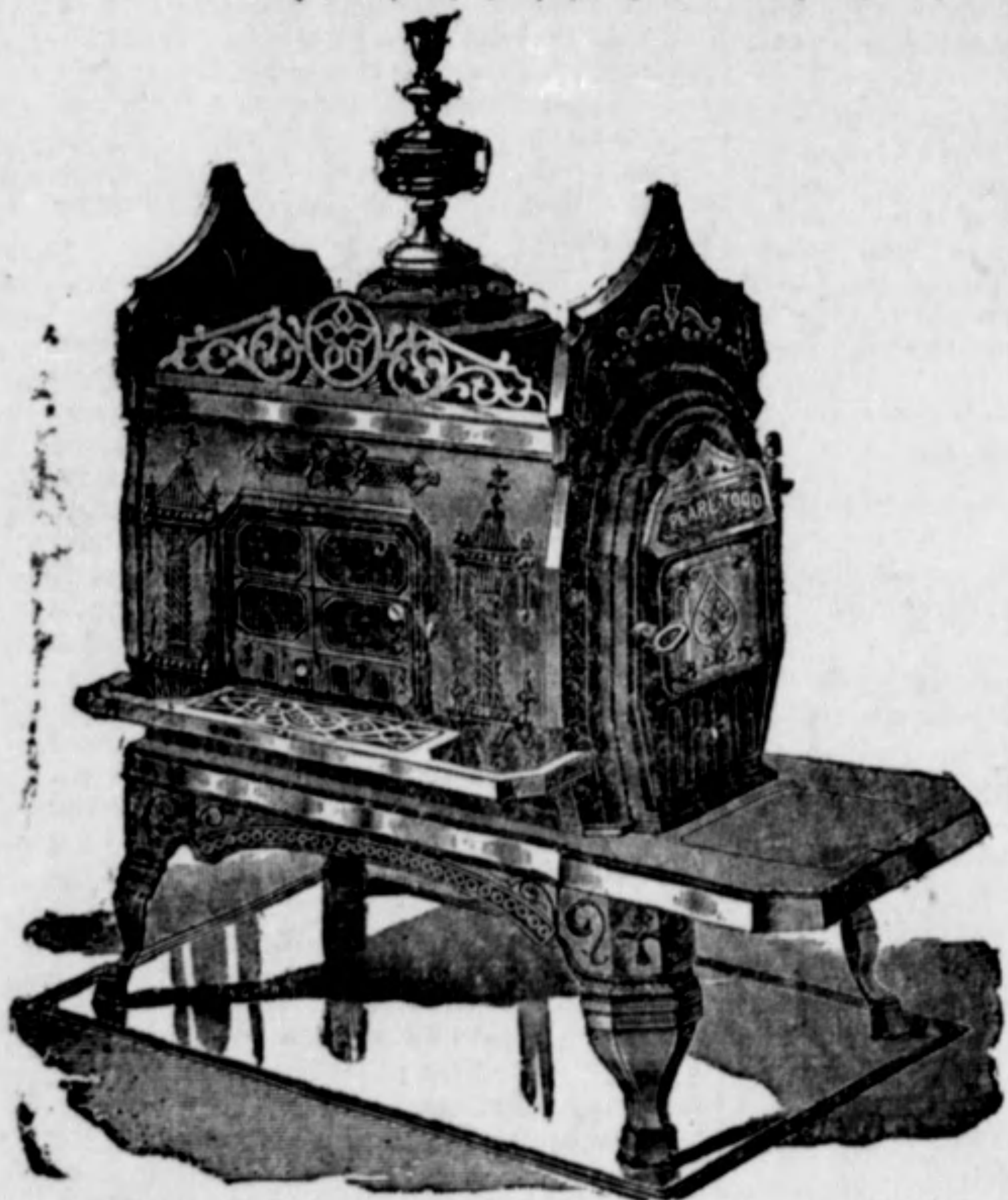
The cheapest Stoves for the weight and style we make.