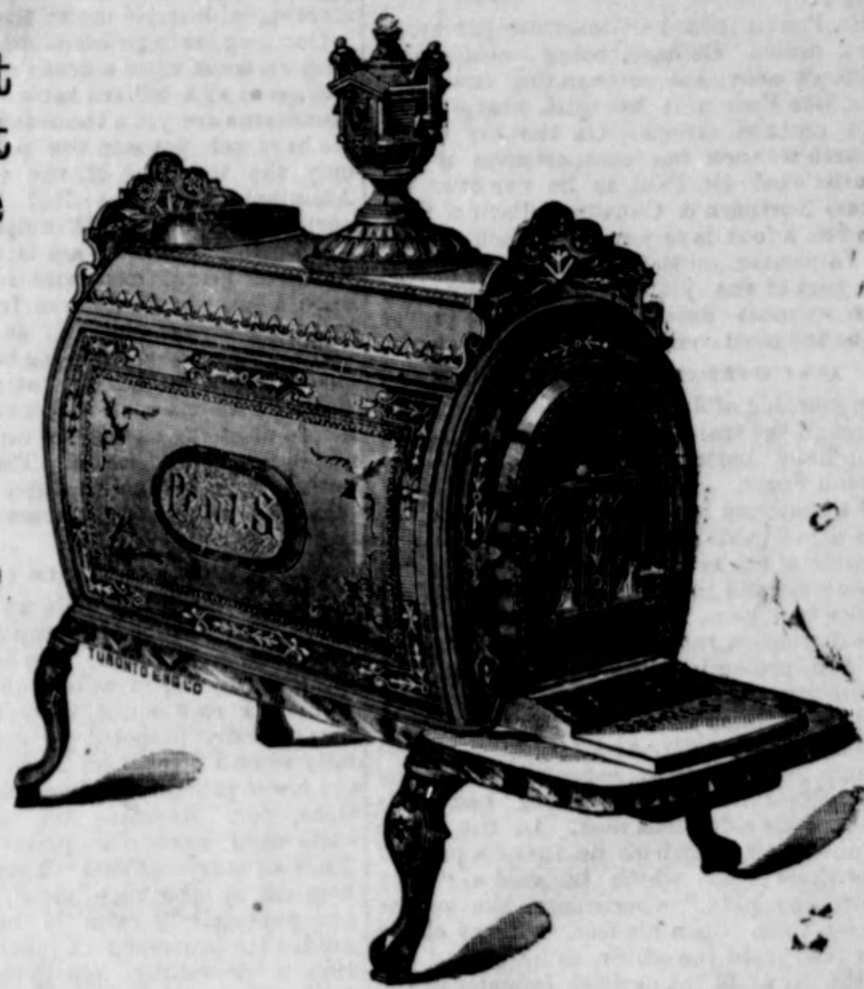
Why buy a box stove when you can get a parlor stove as cheap