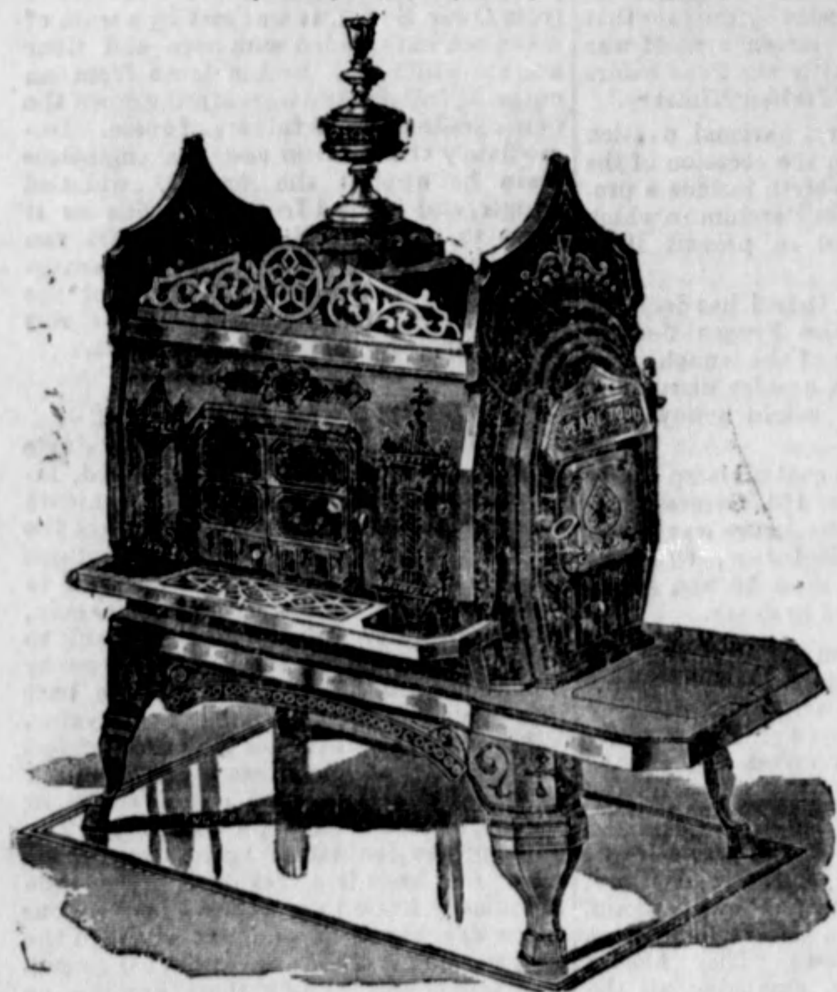
The cheapest Stoves for the weight and style we make.

household reputation throughout Ontario. If your dealer does not keep them write or call on the manufacturers.