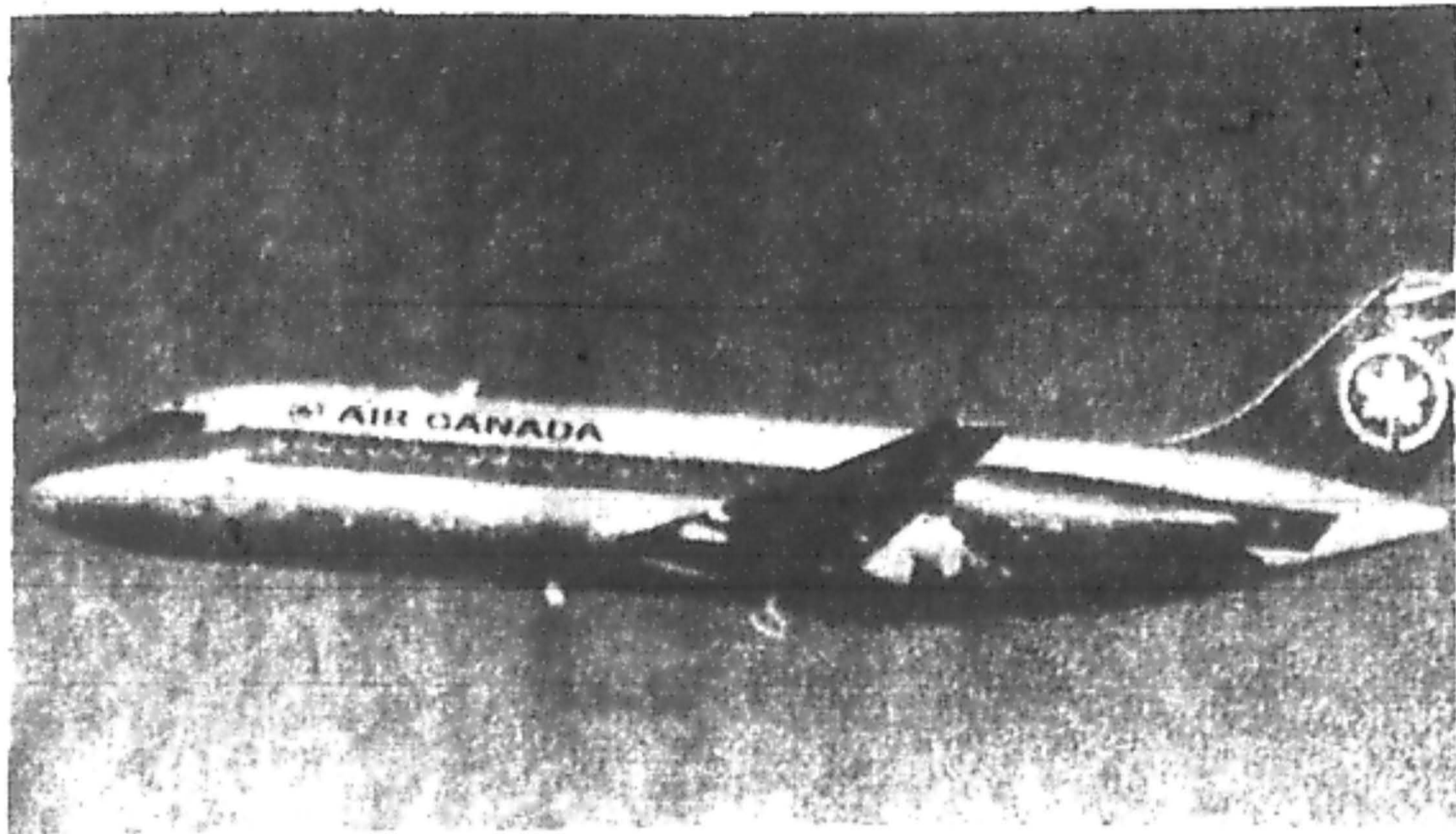
PLANE HIJACKED — This is a stock picture of an Air Canada DC-9 jetliner similar to aircraft with 83

ng these were Mrs. rip with the prime the Soviet Union. ndance at functions