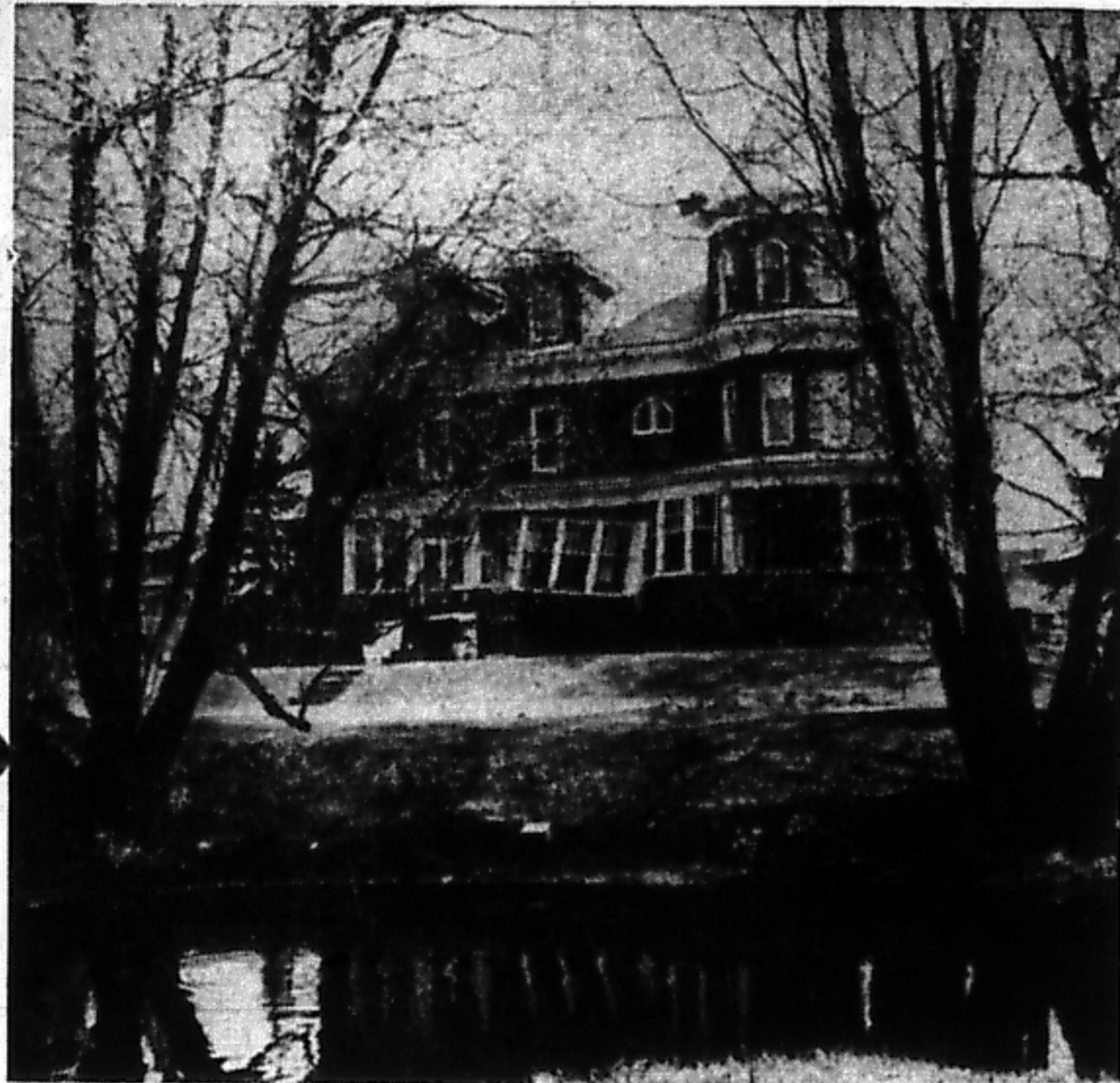
BOMB-SHATTERED HARVEY SMITH HOME