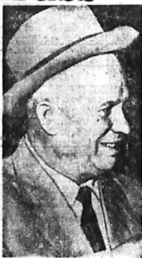
NIKITA KHRUSHCHEV ... not in jail

Defence Minister Harold Watkinson was replying to Labor complaints about the lack of machinery for British-American consultations on employment of the nuclear missile.