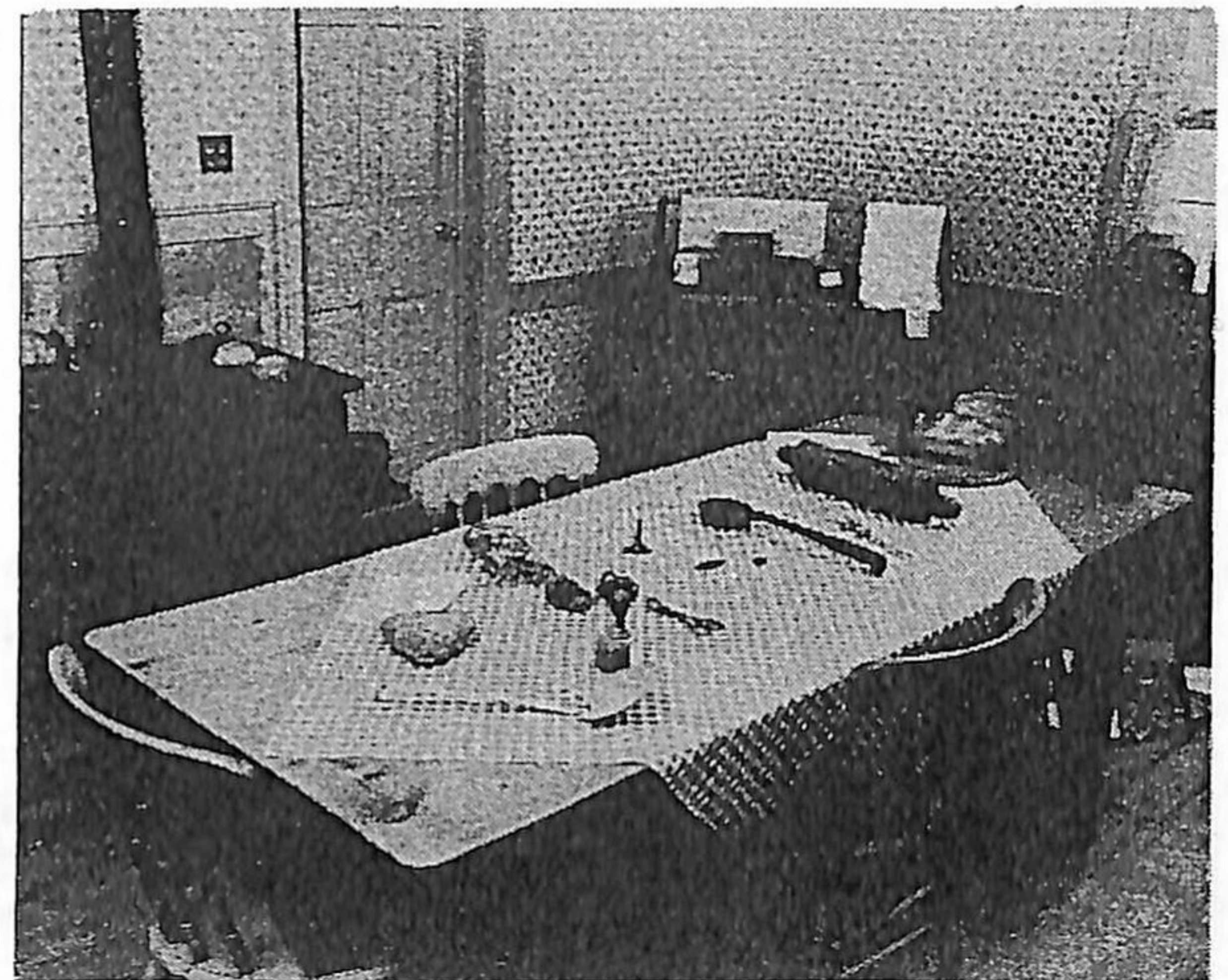
All articles displayed in the "Lee" kitchen gifts from individuals or branches.

"It is good to know the dining room table is still in the Home and a copy of the original Constitution has been preserved." The three Council representatives officially cut the ribbon, then all present were able to browse through the Home.