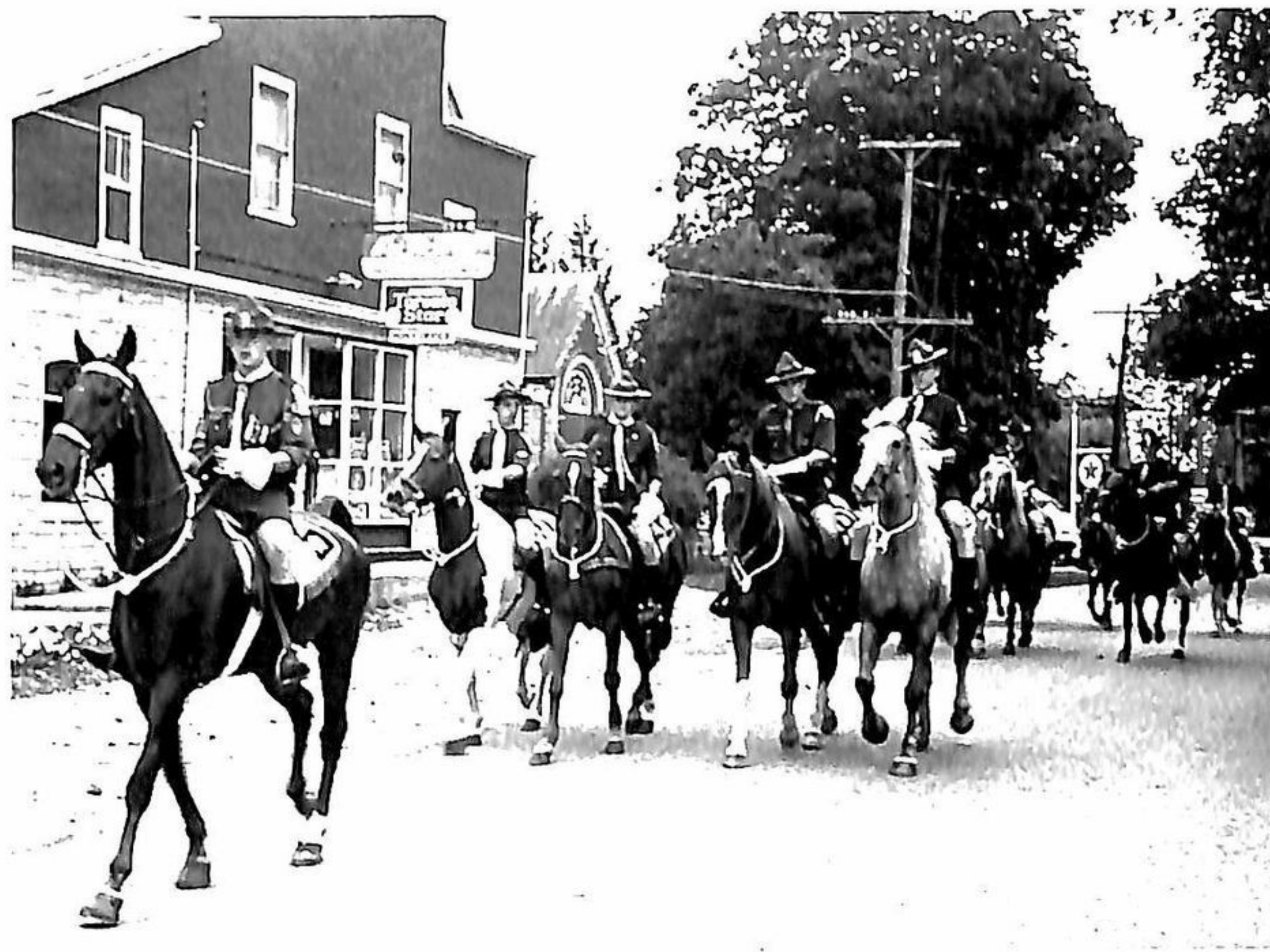
Mounted Scouts outside Springford store

We formed our troop in May 1957 and were very busy and successful until the fall of 1962. As the scouts became older they could no longer be scouts and so new boys had to join. The boys started to raise colts and some sold their horse and it became hard to keep a well trained troop going.