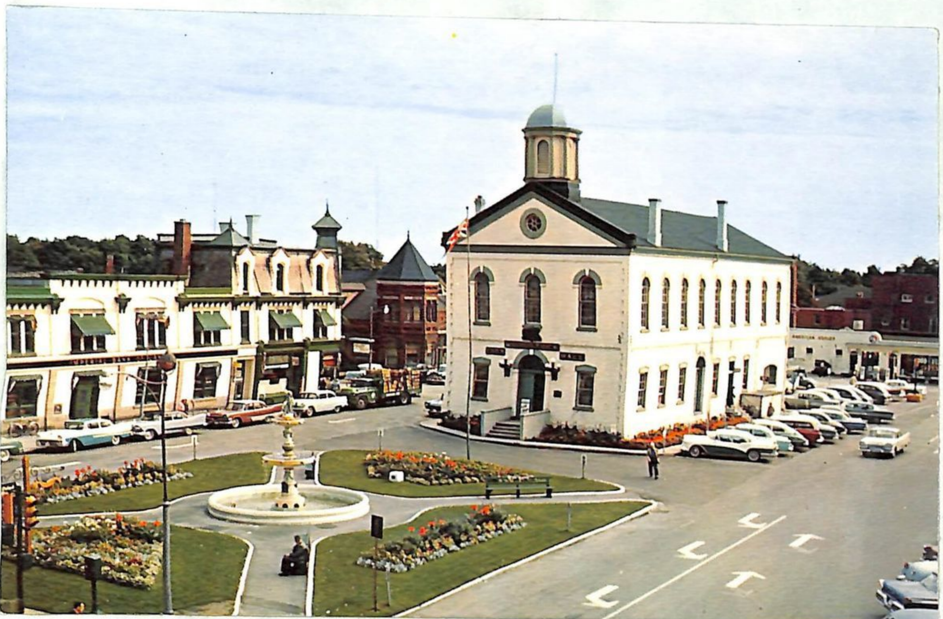
Oxford Museum, Woodstock