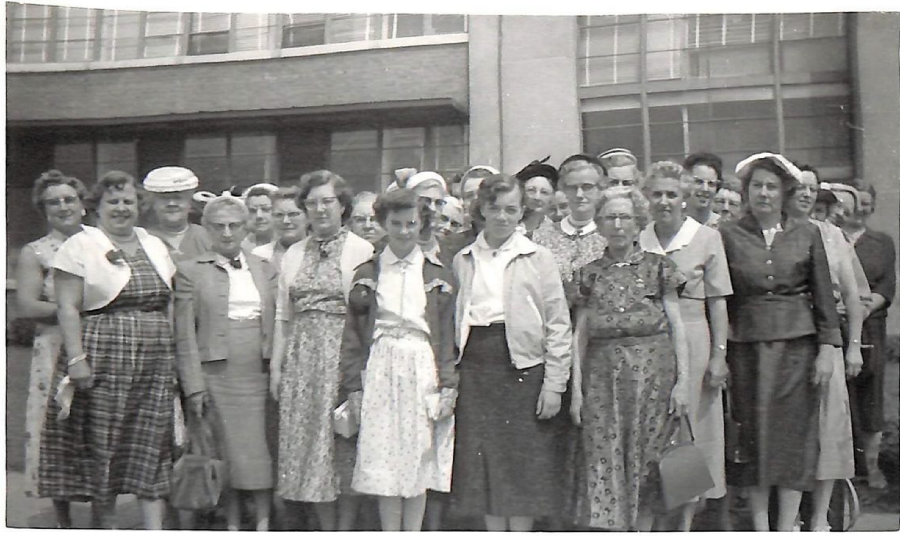
Bus trip to Kitchener