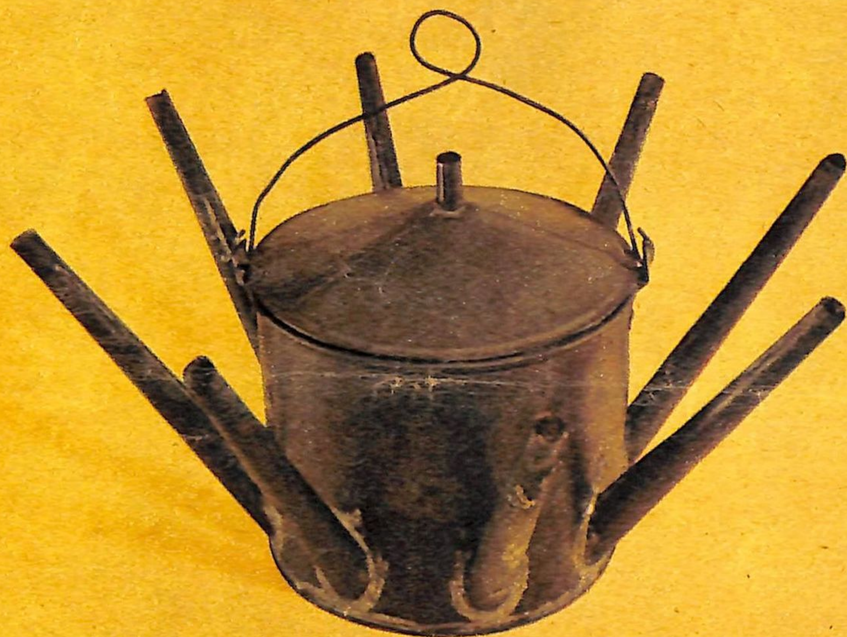
Oil lamp (1840) was for camp meetings, where extra illumination was needed.