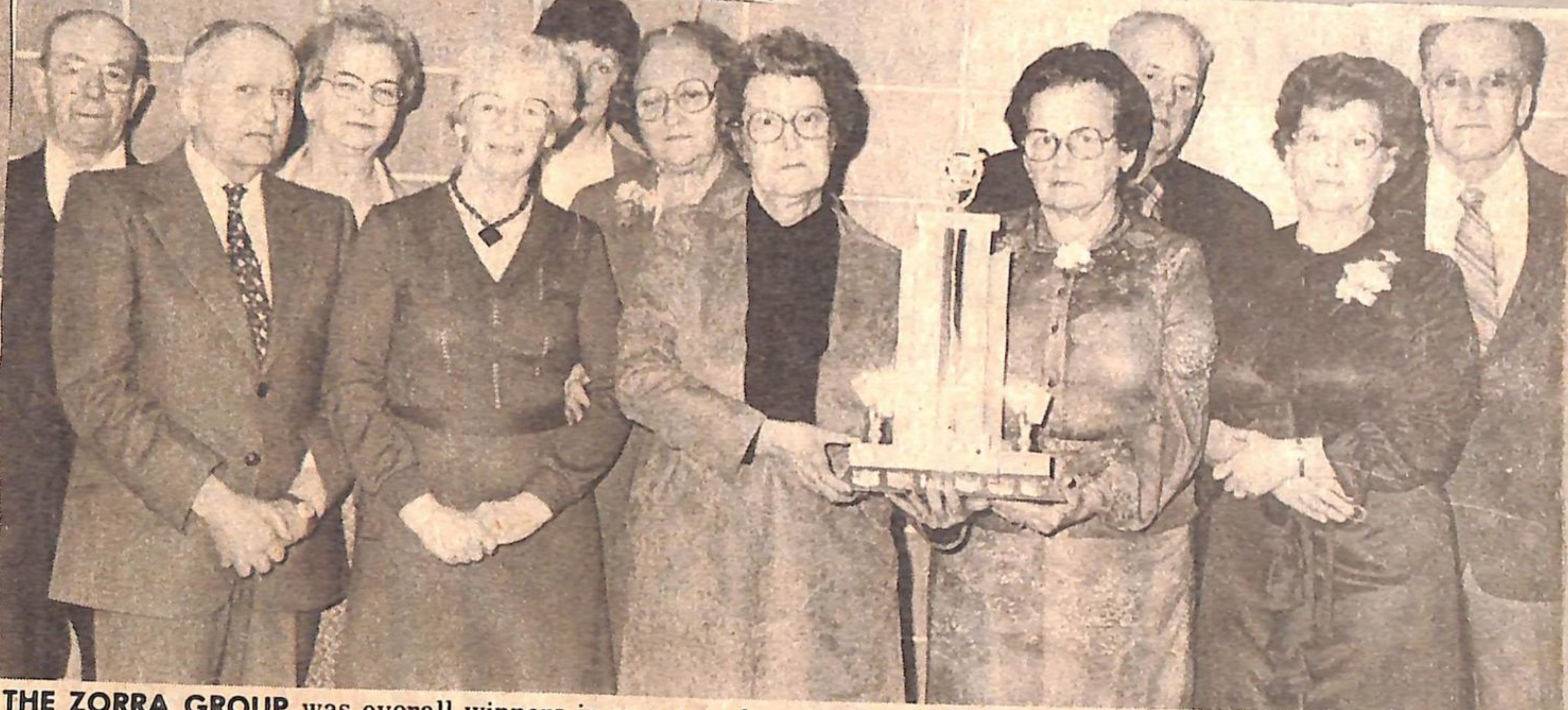
THE ZORRA GROUP was overall winners in games and points for the 12th Area Euchre League this year. They were presented with a trophy at the annual banquet Monday night at the high school. From left, front row: