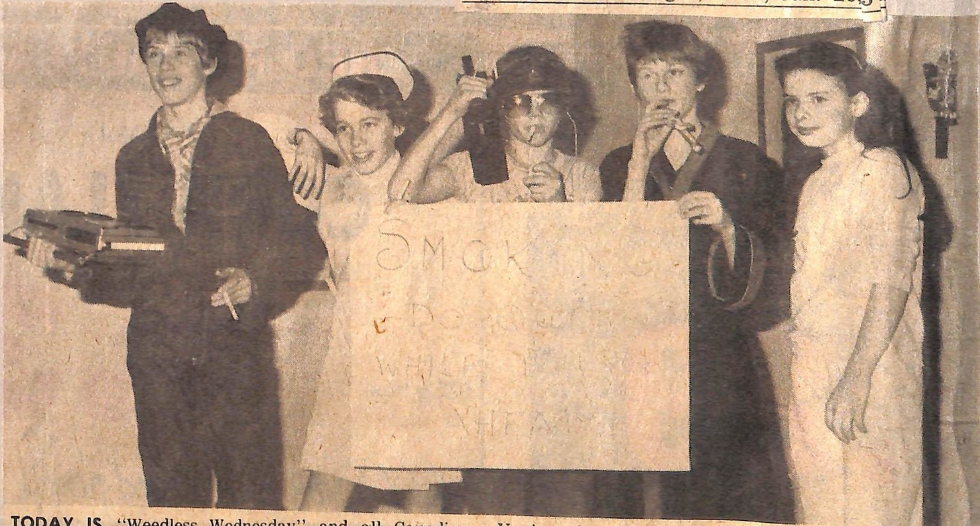
TODAY IS "Weedless Wednesday" and all Canadian smokers are being asked to stub their butts to mark National Non-Smoking Week, which runs Jan. 23-29. Grade 7 students at A. J. Baker in Kintore did a promotion against smoking last Thursday called "Do Quit While