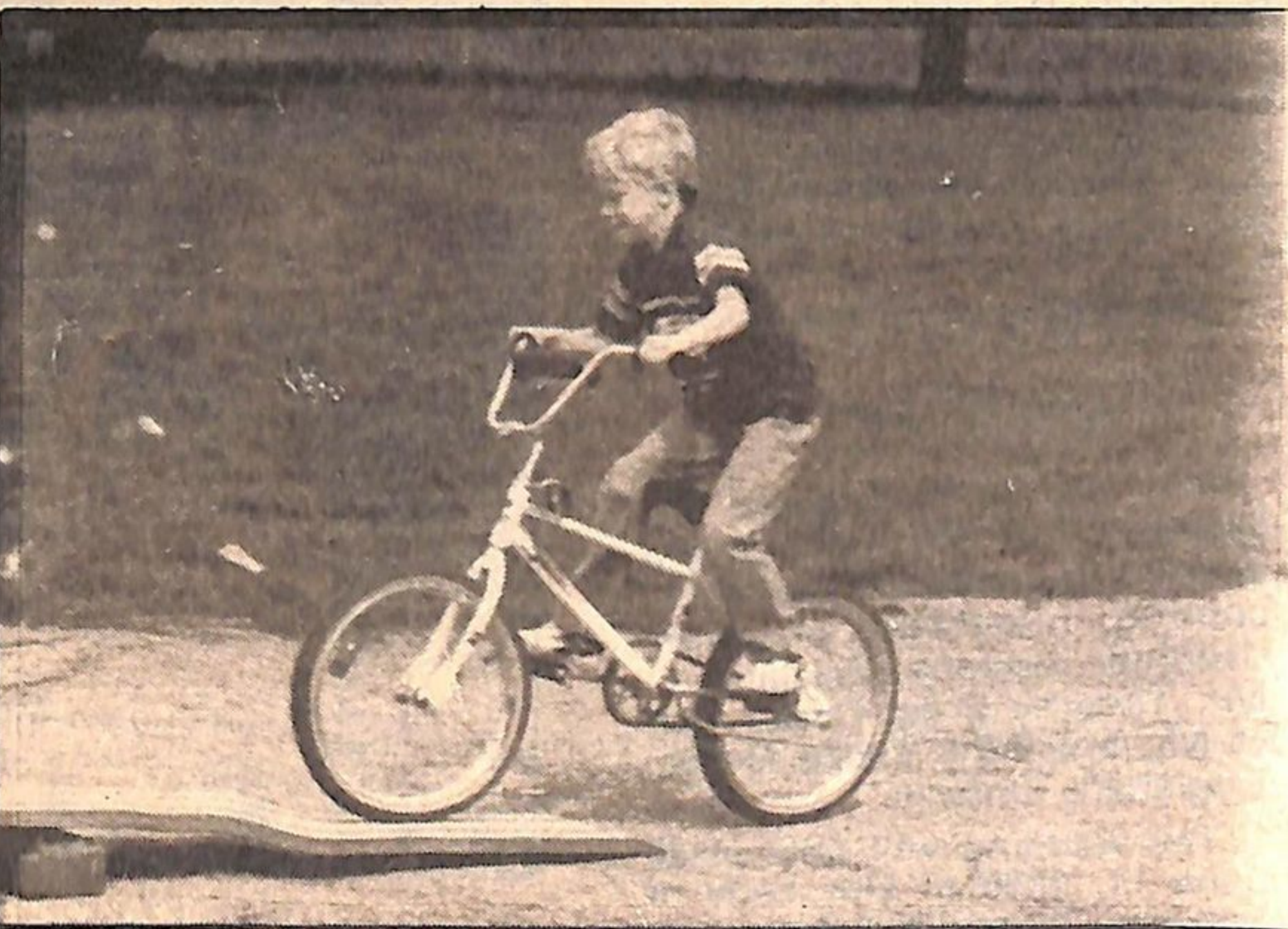
Traversing the teeter-totter at the Thamesford P.S. Bike Rodeo