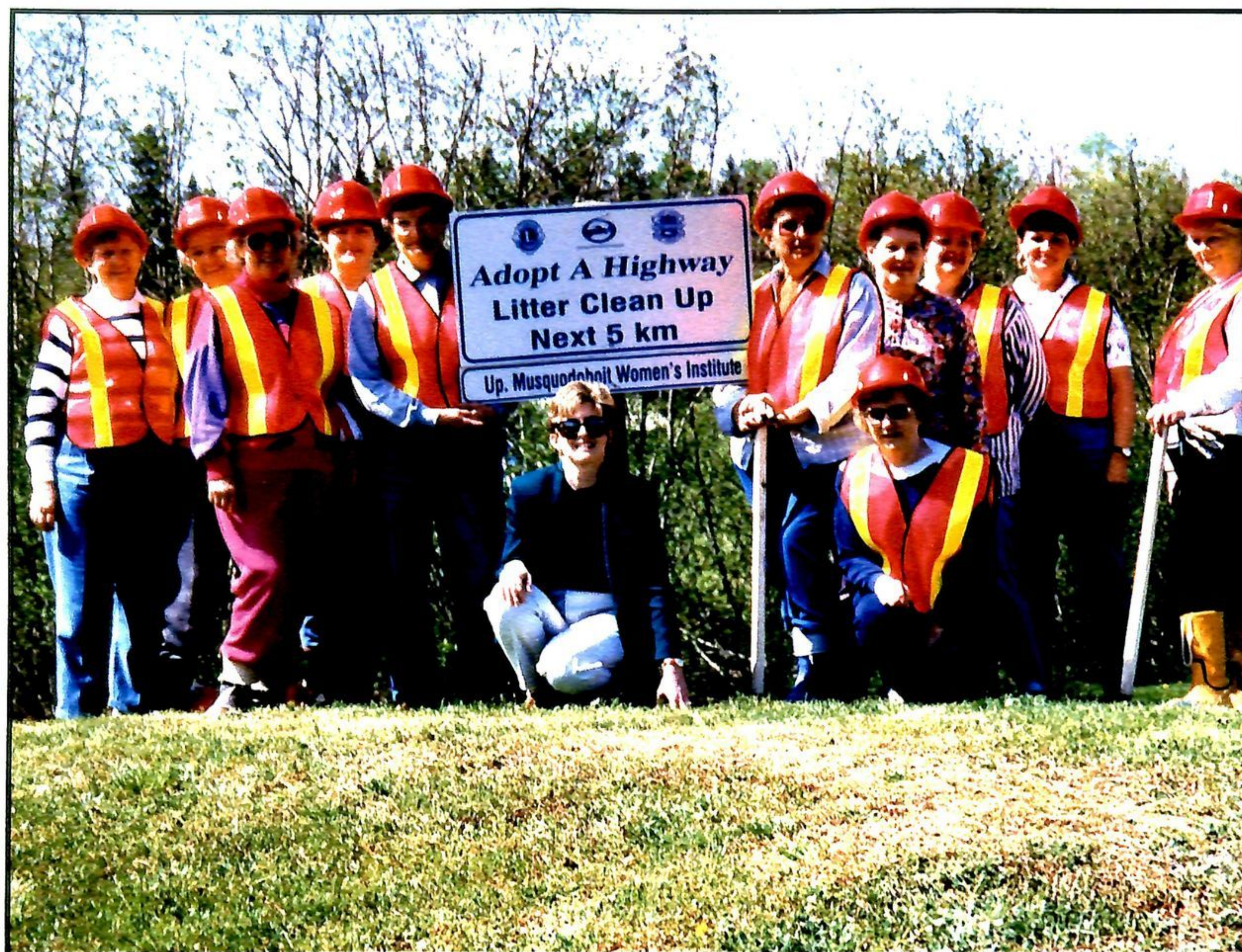
Adopt-A-Highway Program launched, May 29, 1993 . . . Upper Musquodoboit WI was one of the first Women's Institutes in Nova Scotia to take on the Adopt-A-Highway Program in the province. Branches who participate are responsible for the roadside garbage clean up along a 5 km stretch of secondary highway in their community. The provincial project was initiated by WINS, the Lion's Club, the Clean Nova Scotia Foundation and the NS Department of Transportation and Communications.