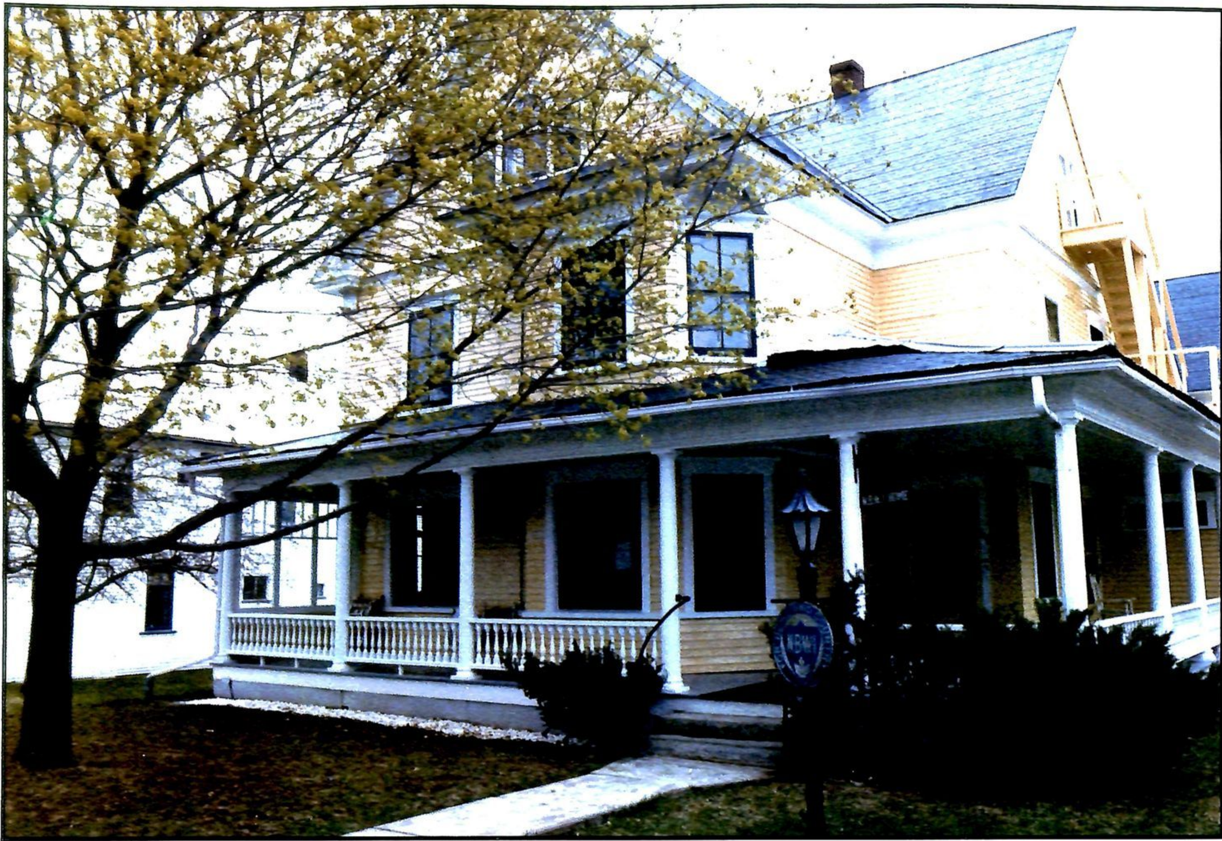
W.I. HOME at 189 Chapel Street, Woodstock, New Brunswick established by the New Brunswick Women's Institutes in 1952, a comfortable residence for senior women and the only home in Canada, owned and operated by W.I. members