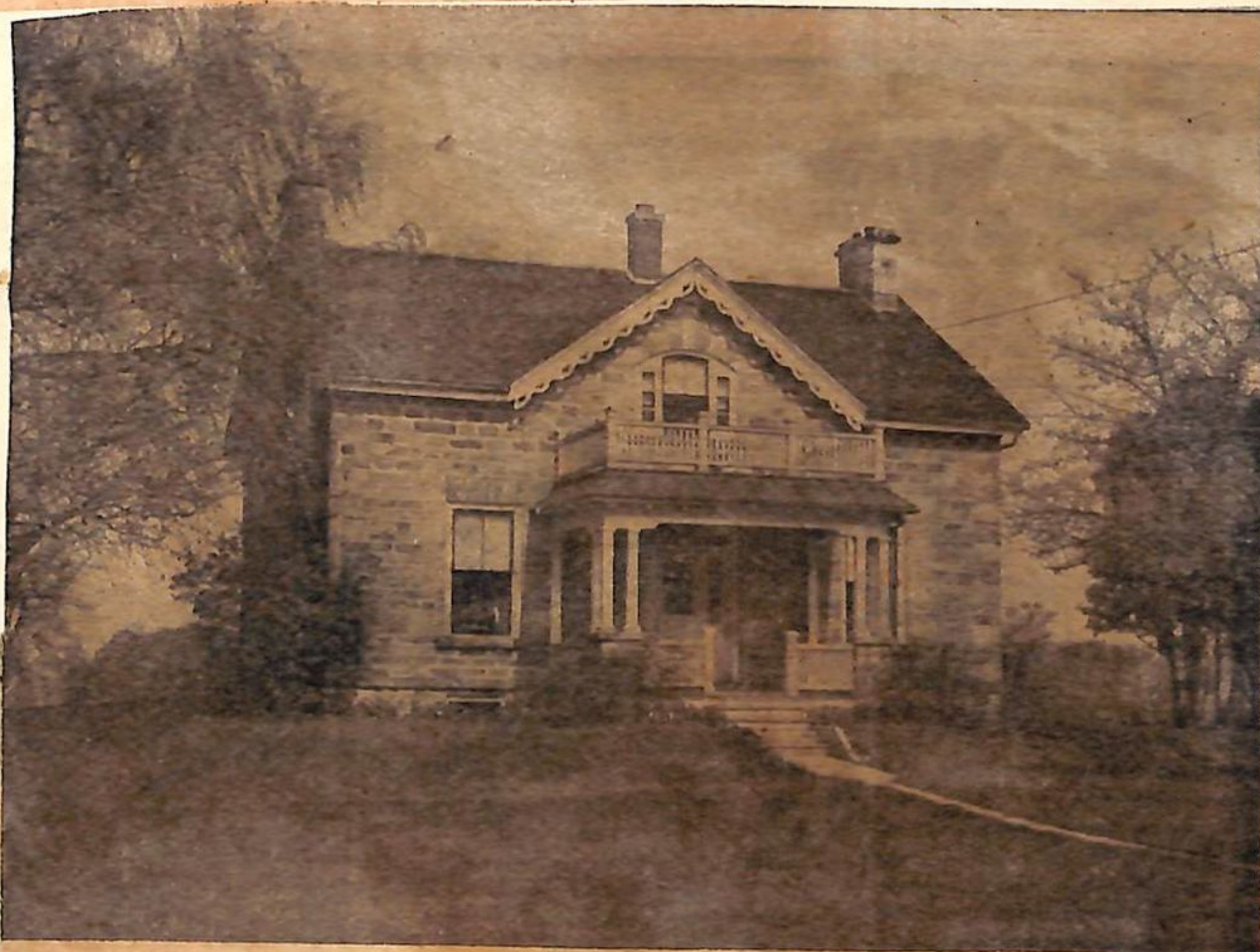
THE MANSE GLEN MORRIS