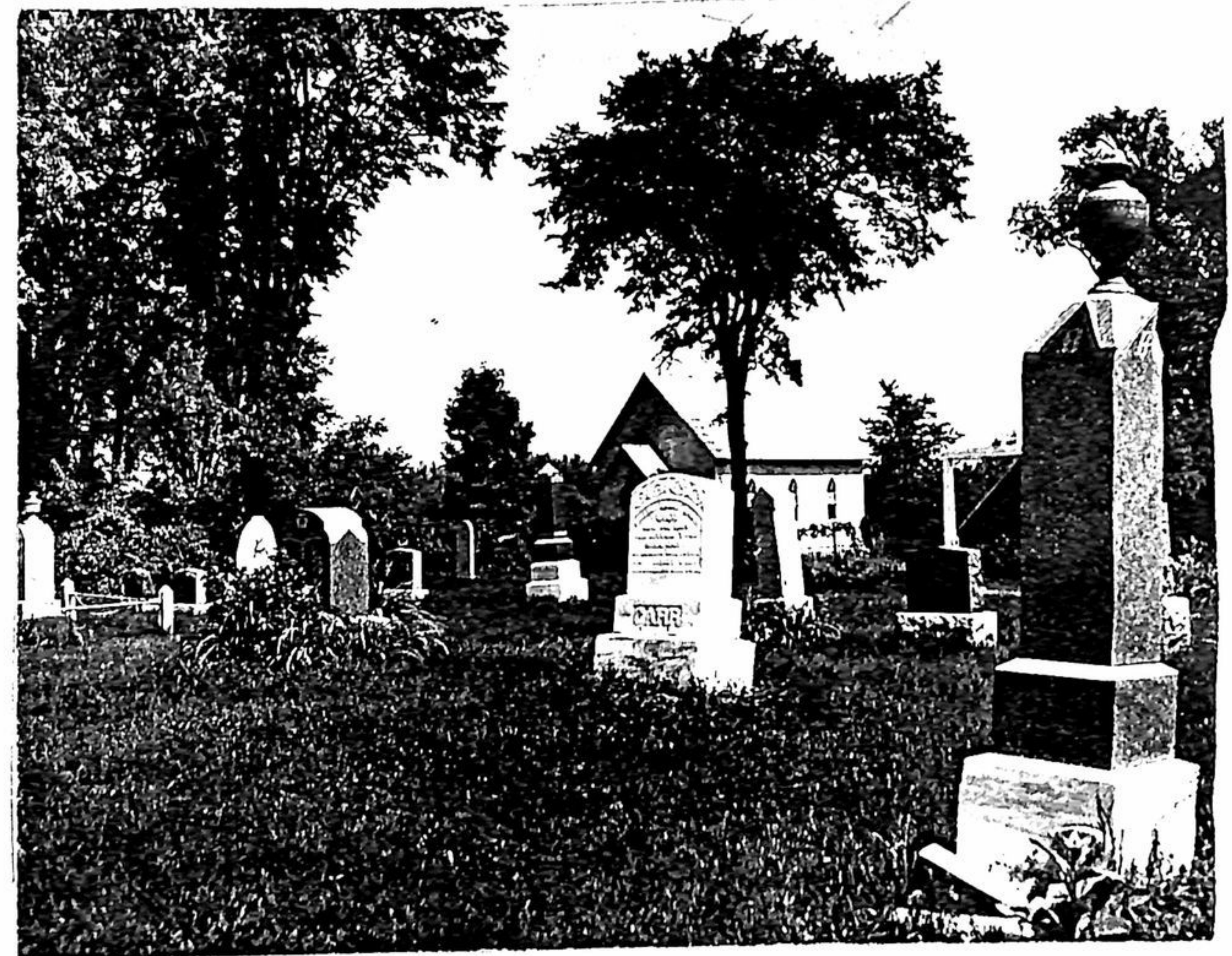
EPWORTH CHURCH AND CEMETERY