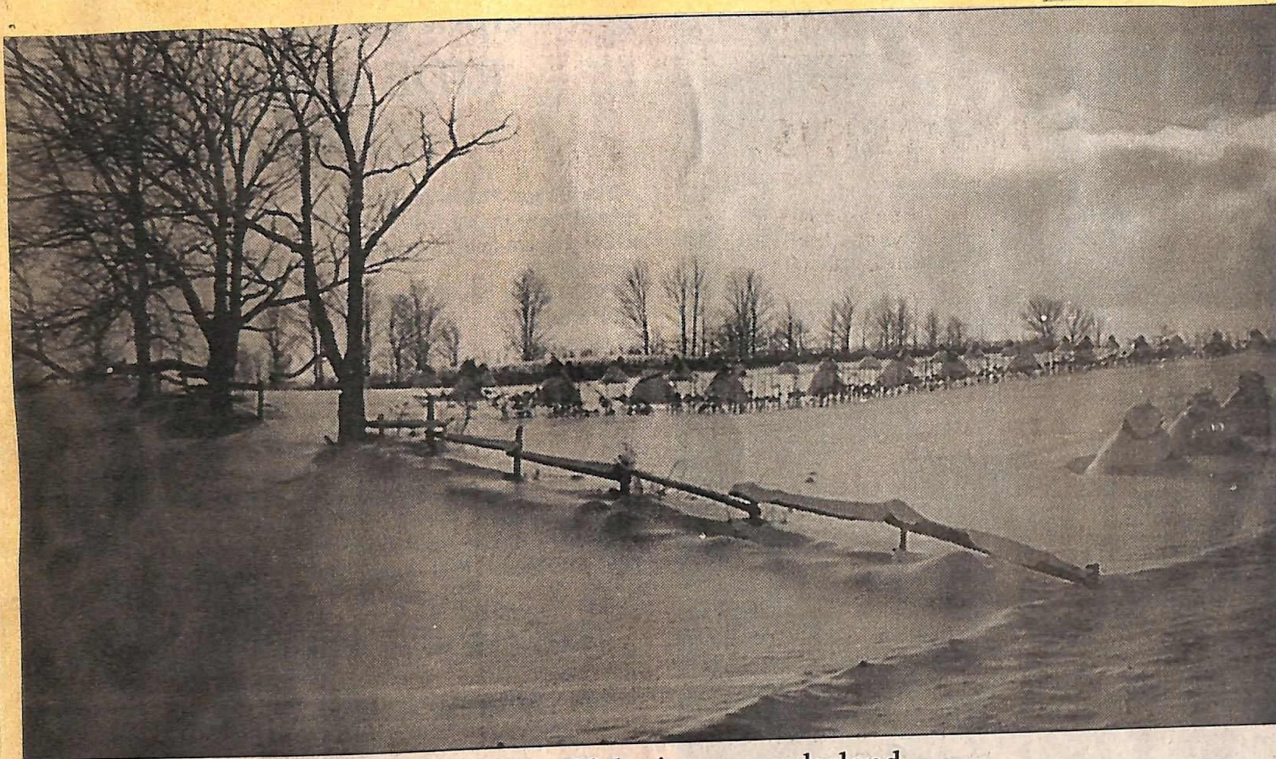
What a beautiful winter wonderland last week's heavy snowfall left behind!!