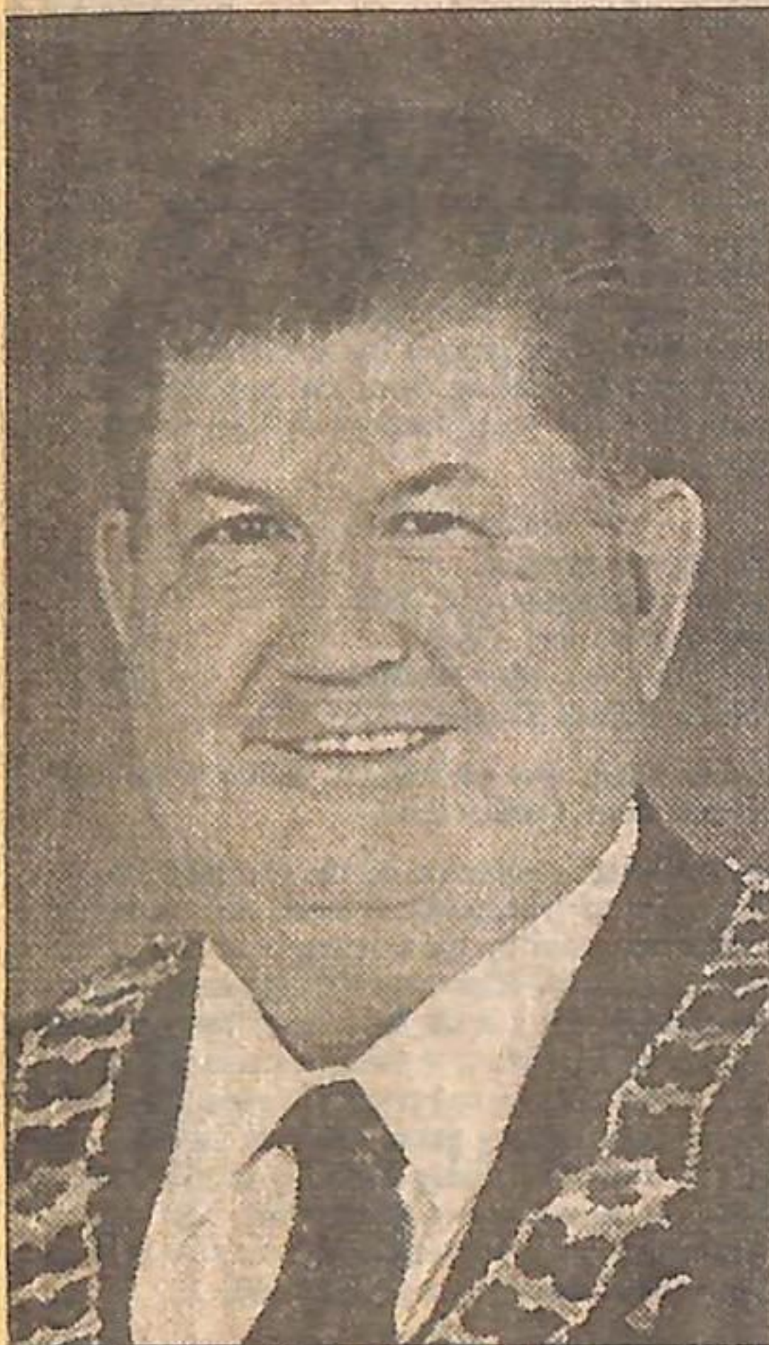
Mayor James Jacklin