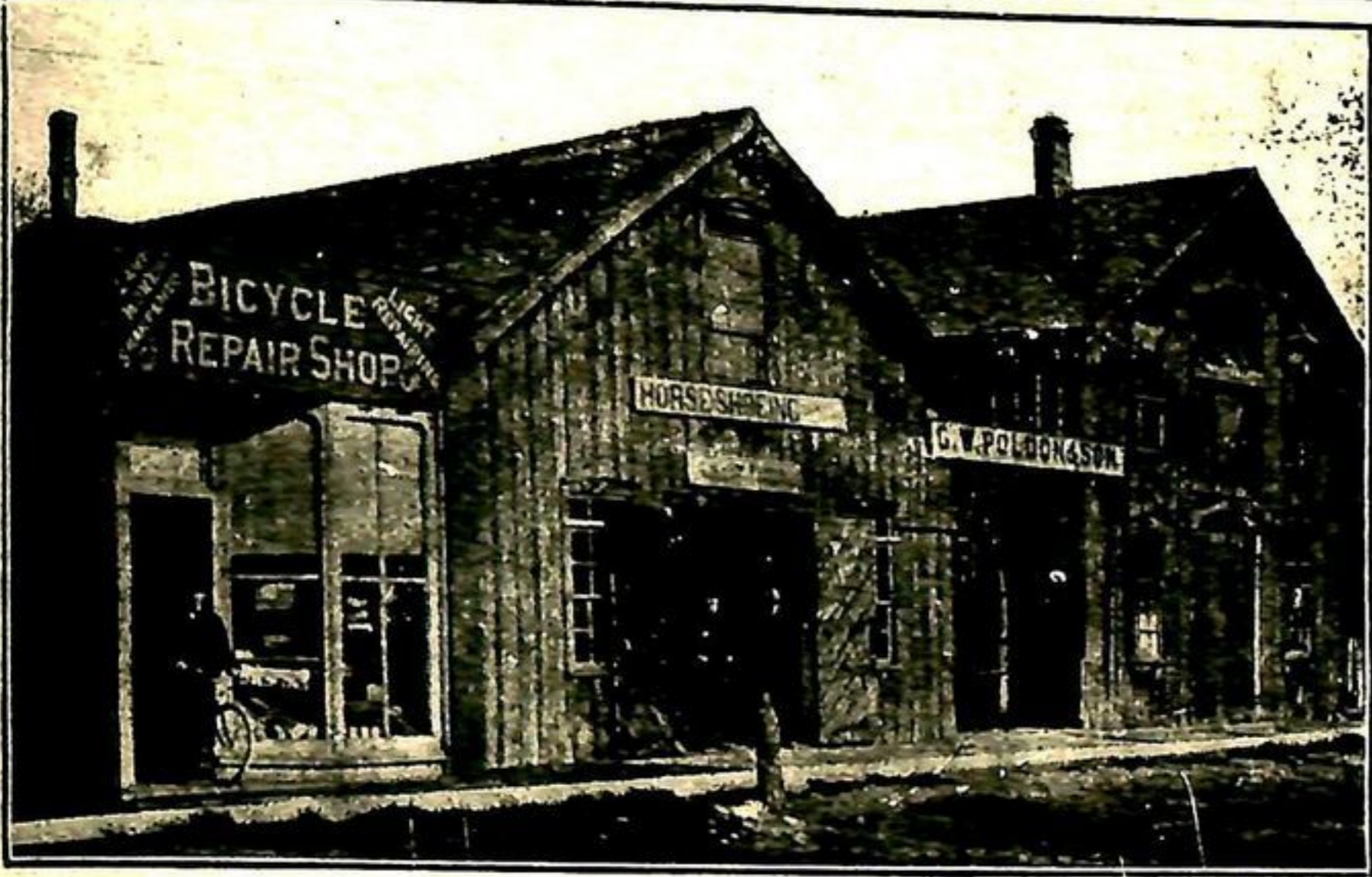
The former G.W. Polden and Son bicycle and blacksmith shop on Stover St. over 60 years ago. Site now cleared, just east of Maedels Foodmaster.