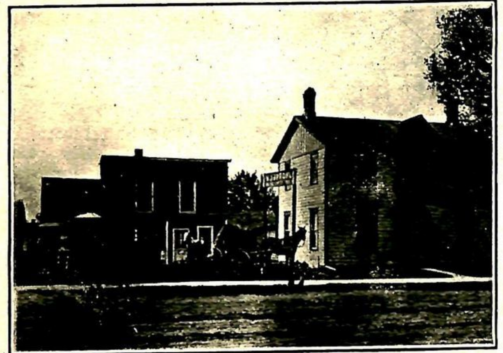
The old Sprowl Livery in 1910, site now occupied by Lynn-Wayne Motors on Main St. West, Norwich.