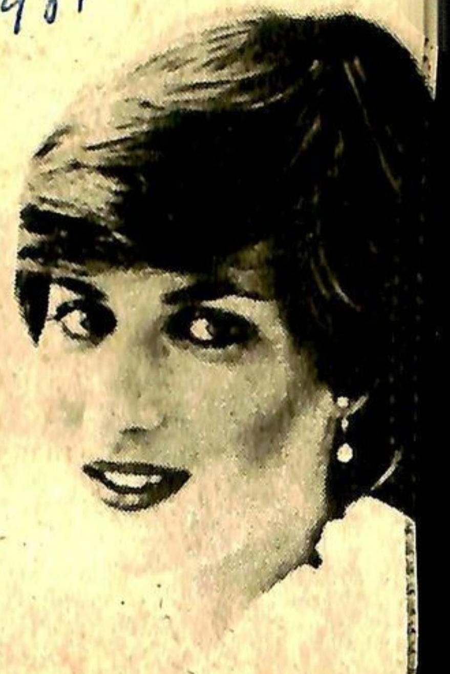
LADY DIANA July bride

The Queen's Silver Jubilee was celebrated there in 1977. And the Thanksgiving Service for the Queen Mother's 80th birthday was held there last year.