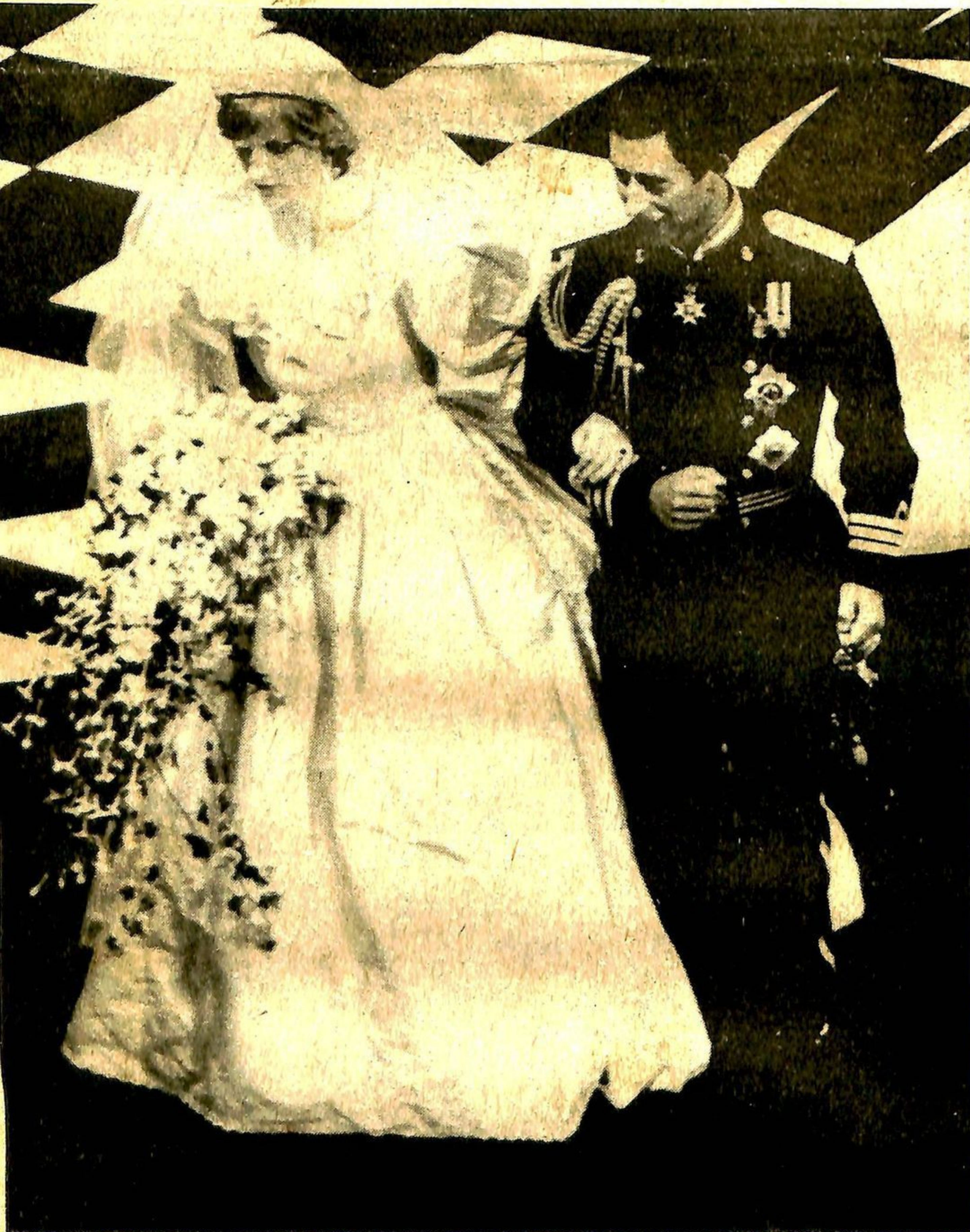
A TUMULTUOUS reception rose to a mighty crescendo when the prince and his bride appeared after their 80-minute wedding ceremony. June 1981