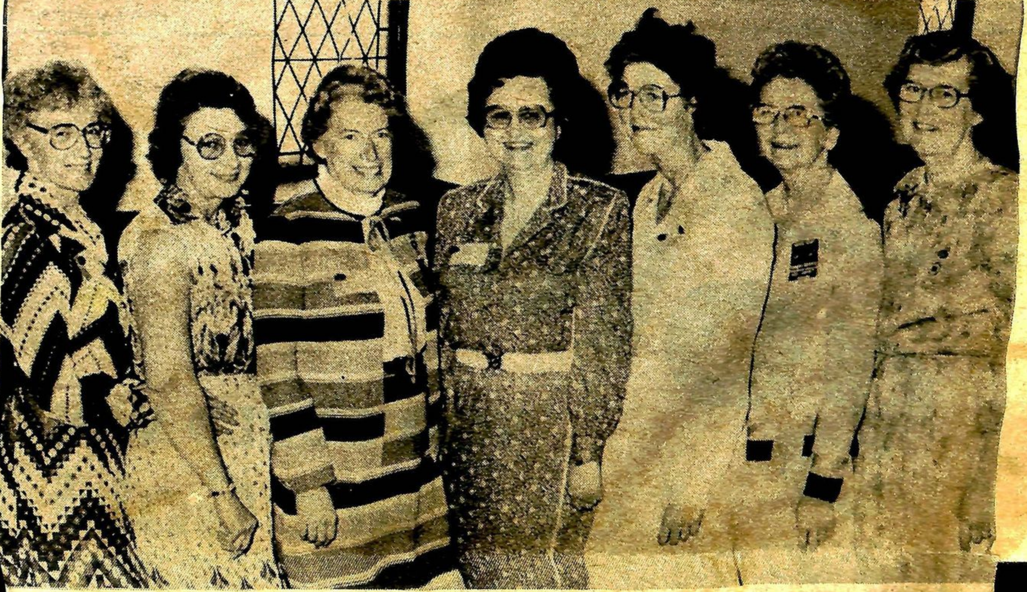
Page 6 THE NORWICH GAZETTE May 21, 1980

Terry Fox is the youngest recipient of the award.