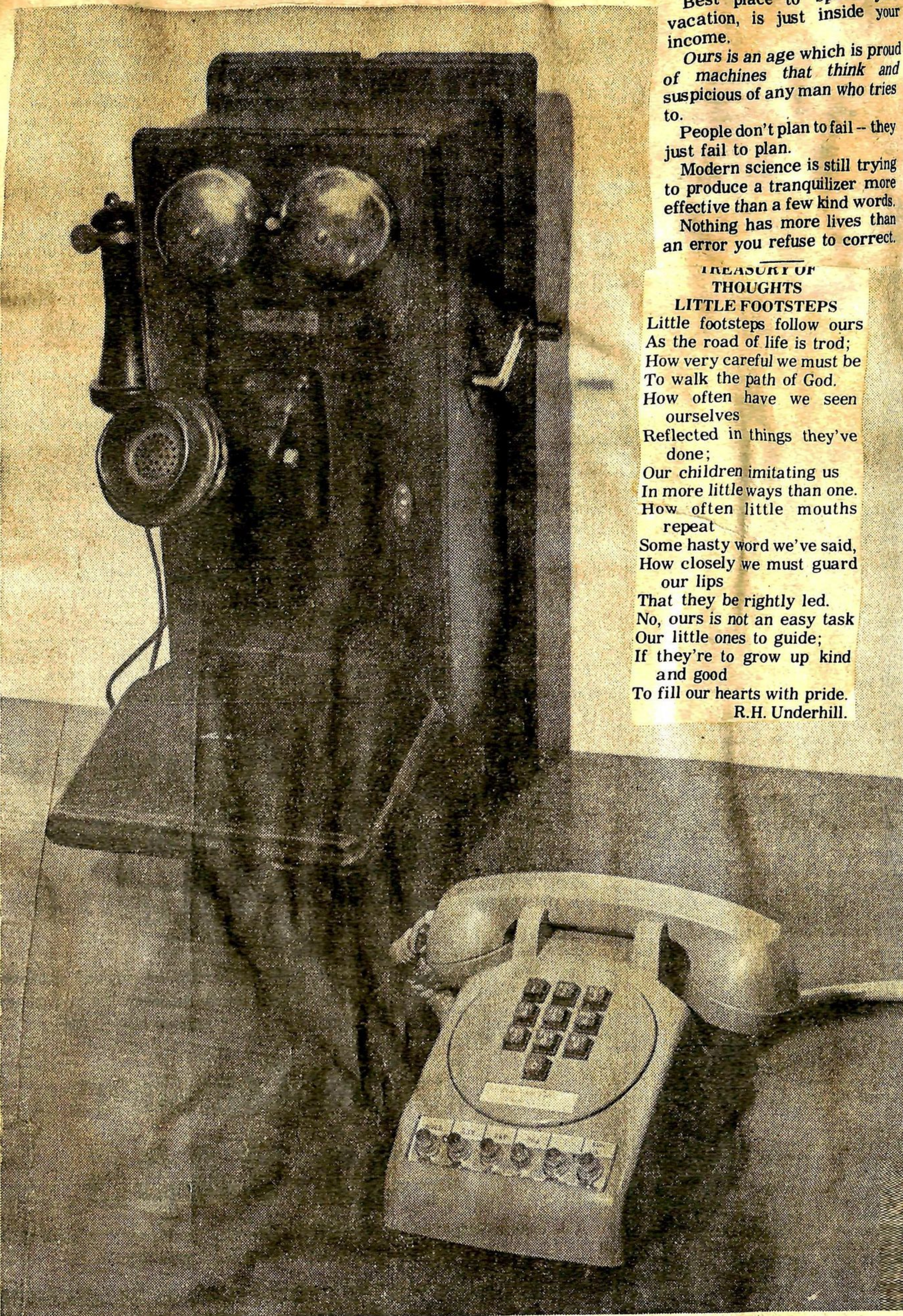
These two telephones were manufactured exactly 50 years apart. Left is the hand generator-type wall phone, made in July, 1915. Right is the new push button type made in July, 1965.

OUR WISDOM CORNER: Best place to spend your vacation, is just inside your income. Ours is an age which is proud of machines that think and suspicious of any man who tries to. People don't plan to fail -- they just fail to plan. Modern science is still trying to produce a tranquilizer more effective than a few kind words. Nothing has more lives than an error you refuse to correct.