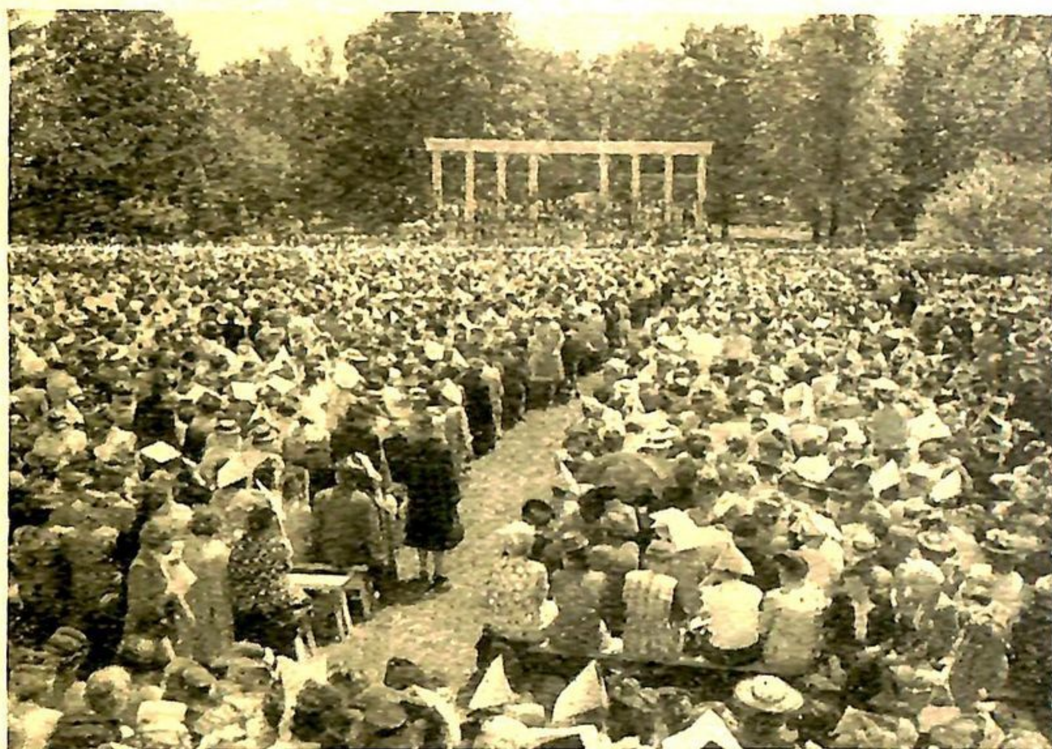
ANOTHER VIEW OF W.I. CELEBRATION CROWD

With the beautiful administration building of the O.A.C. as a background, this photograph, taken from the platform, shows part of the crowd at the Women's Institute 50th Anniversary Celebration.