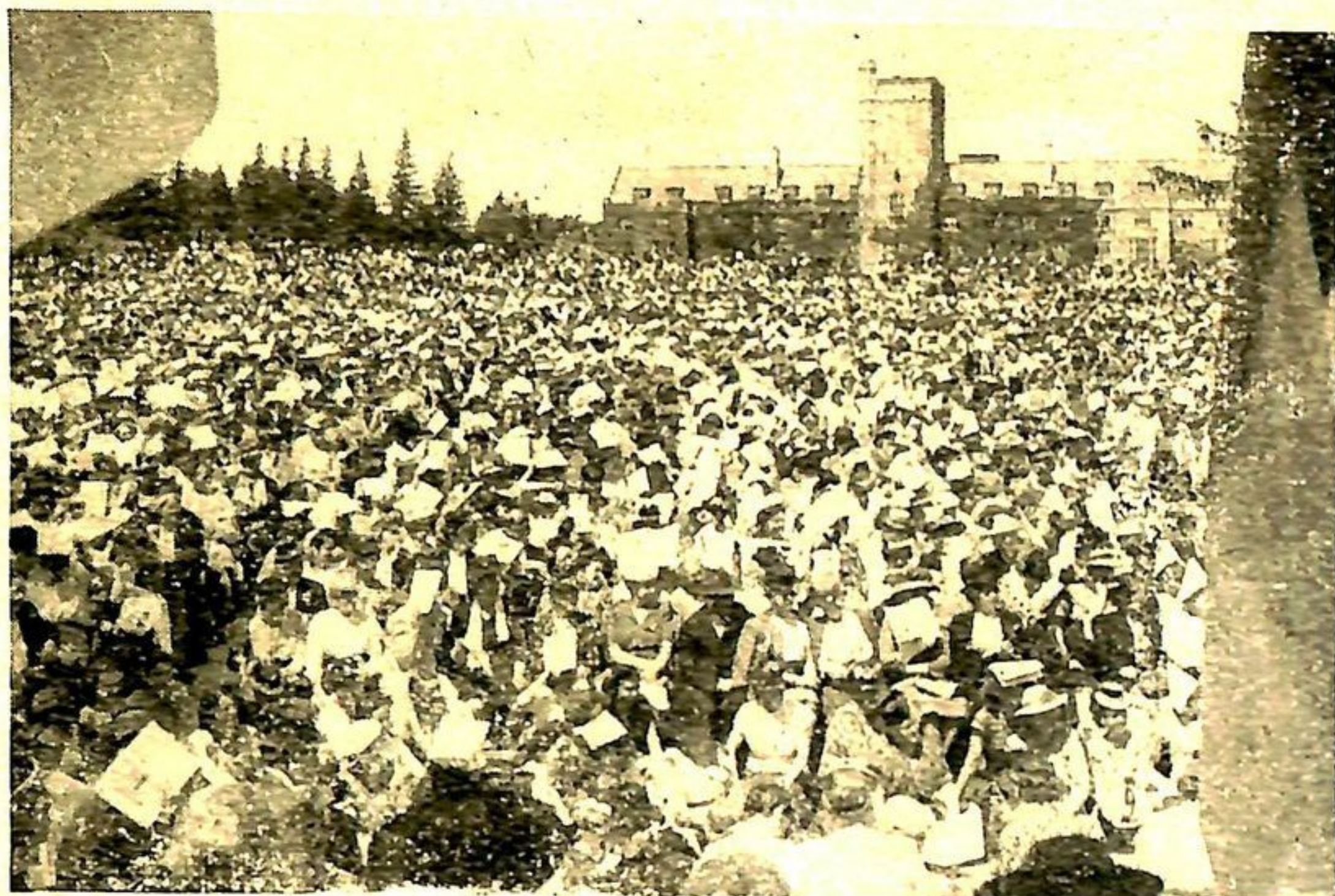
CROWD OF 12,000 VIEWS PAGEANT