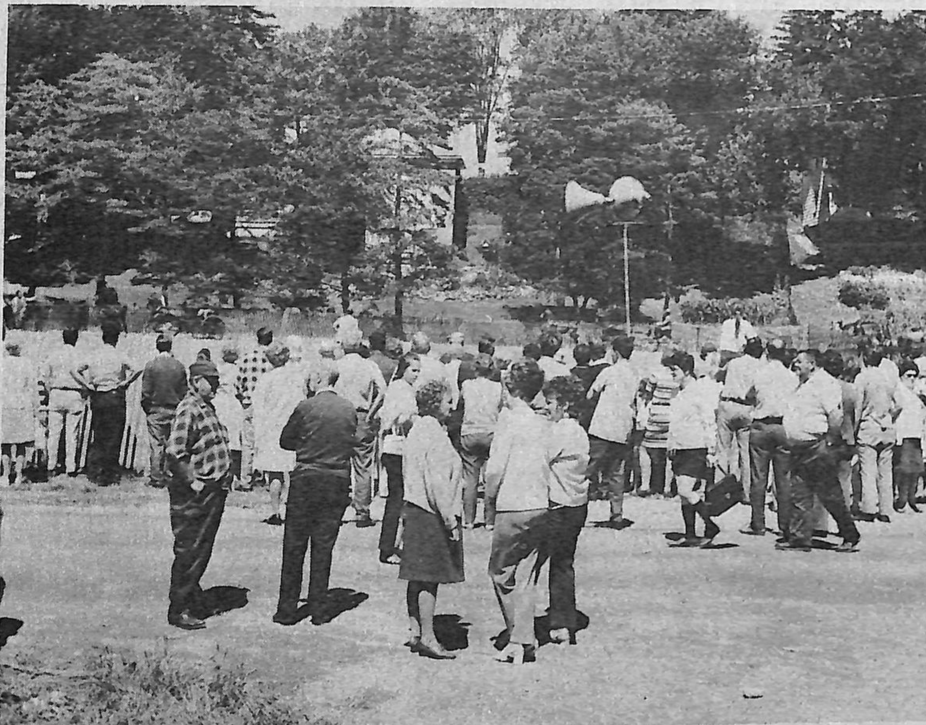
WATCHING A HORSE SHOW — a popular pastime at the recent fair. Facilities on the Flats, along with the pleasant surroundings, added much to the success of the 1971 St. Marys Fair.

—THAT the cucumber harvest is in full swing. The rather back-breaking chore of picking has been greatly helped, at least along one patch on the 8th concession of East Nissouri by a self-propelled machine carrying six youngsters abreast, picking three rows at a time. The machine is powered by a small gasoline engine.