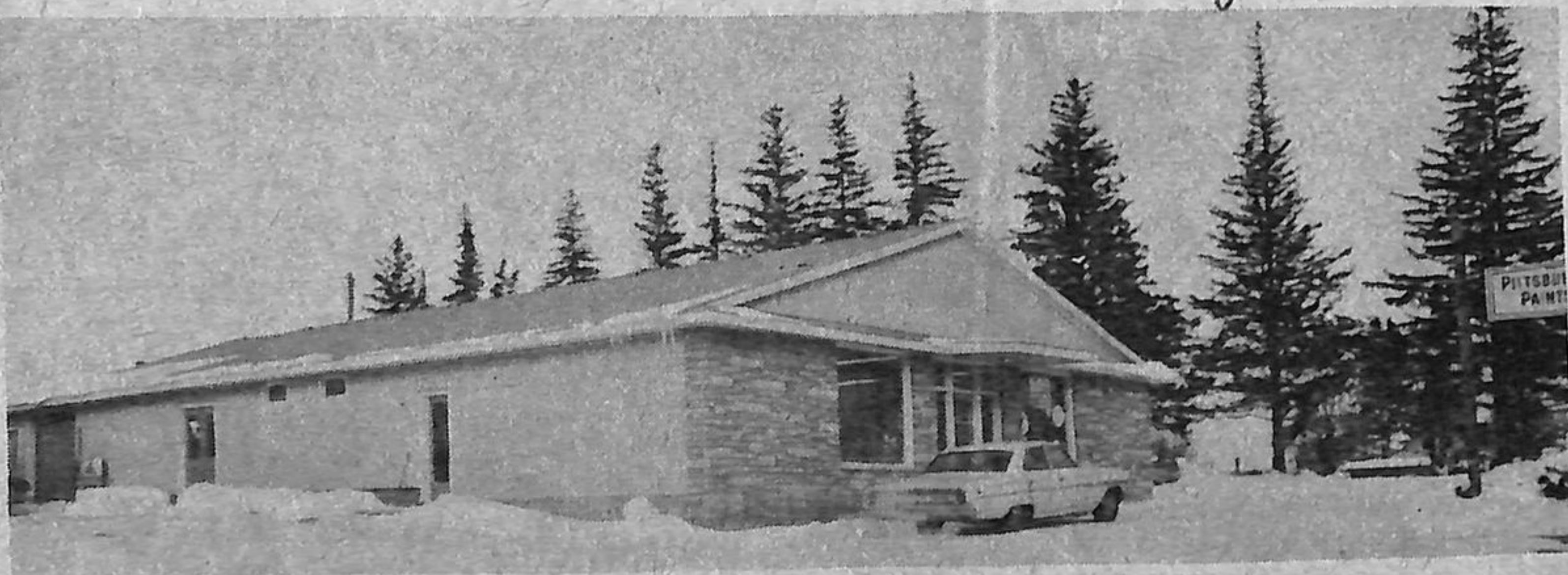
BAIRD LUMBER — This is the fine new replacement for the building destroyed by fire early in 1970.