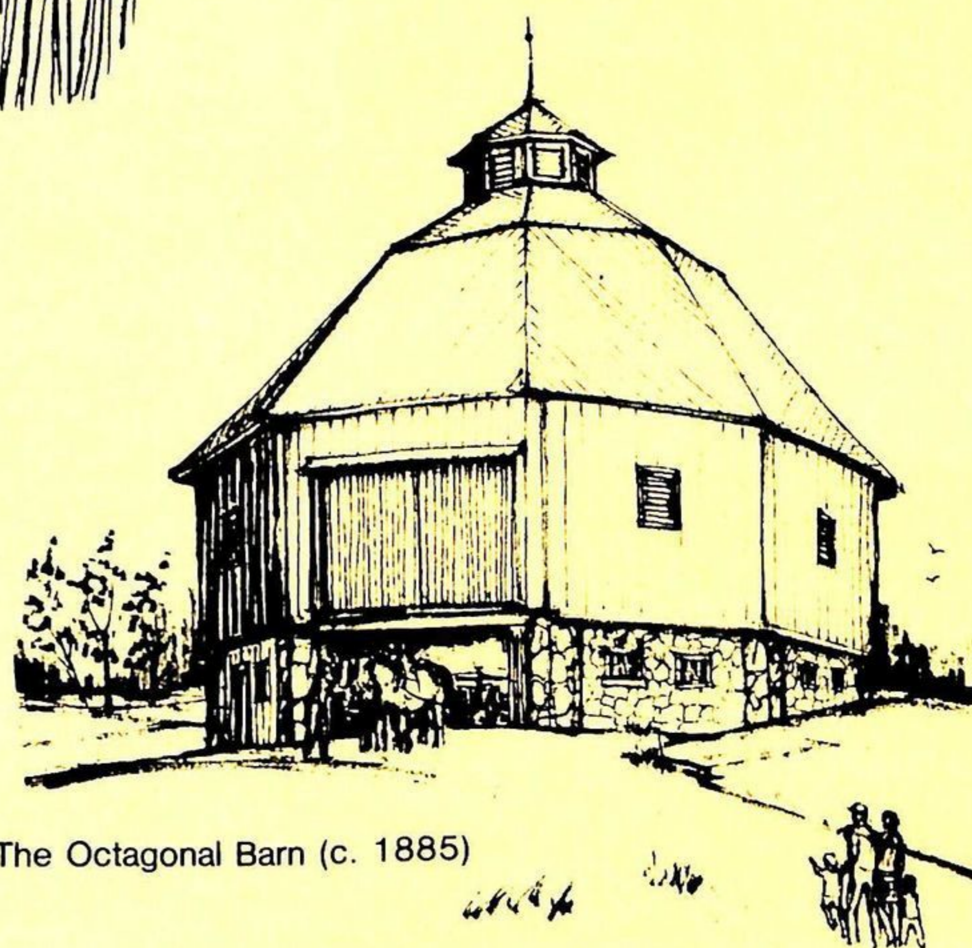
The Octagonal Barn (c. 1885)

ONTARIO'S RURAL HISTORY COMES ALIVE AT THE ONTARIO AGRICULTURAL MUSEUM!