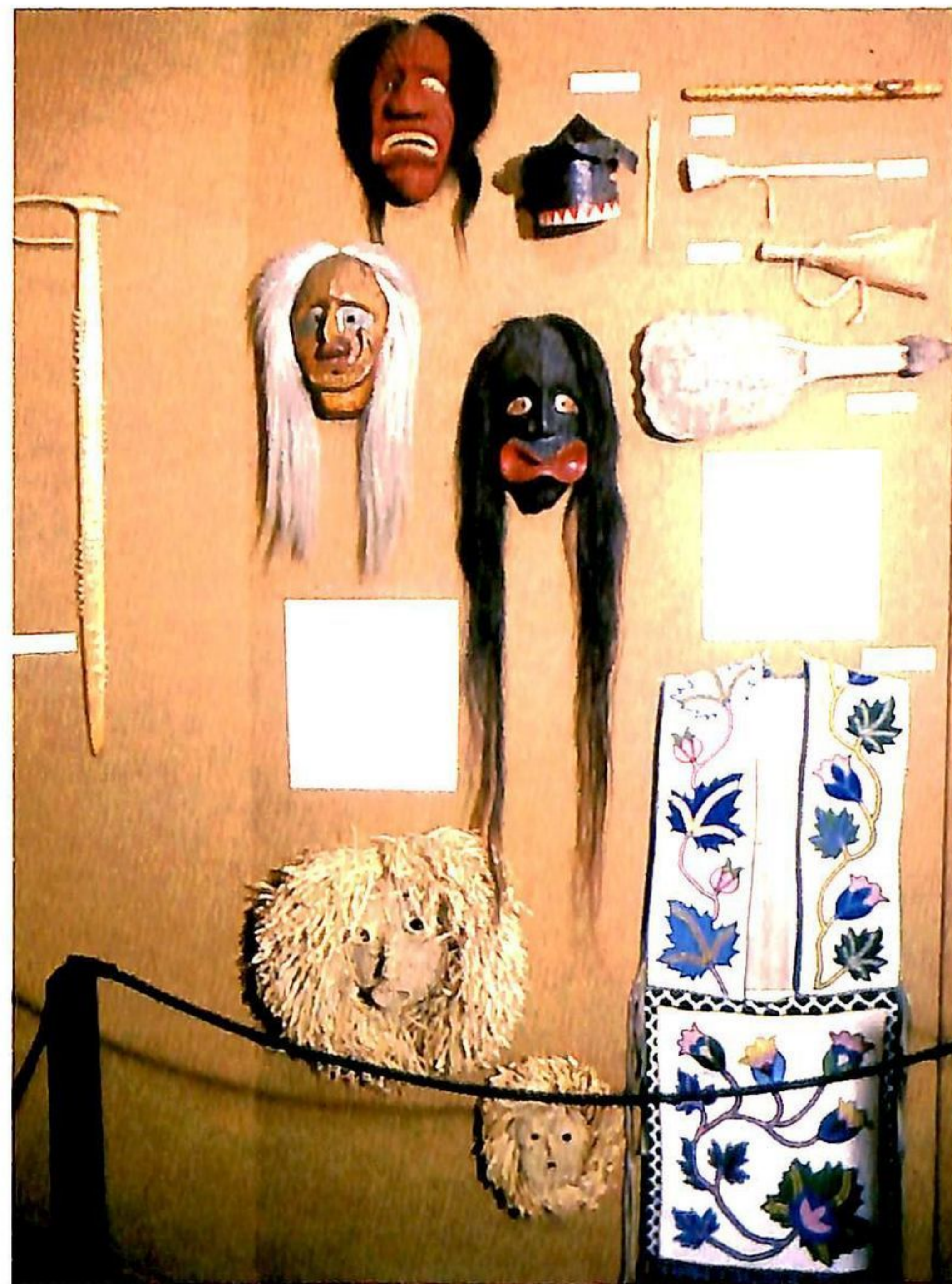
Native Ceremonial Artifacts

Many of the artifacts on view in the gallery were found locally during archeological digs.