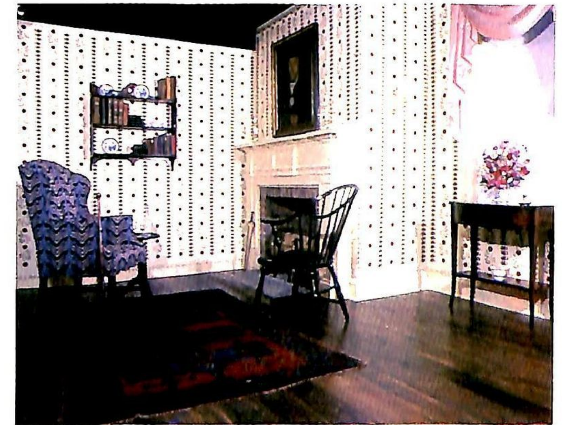
Joseph Brant Parlour, Circa 1800

Also featured is a portion of a restored parlour "in the English style", representative of the manner in which Joseph Brant furnished his home, Wellington Square.