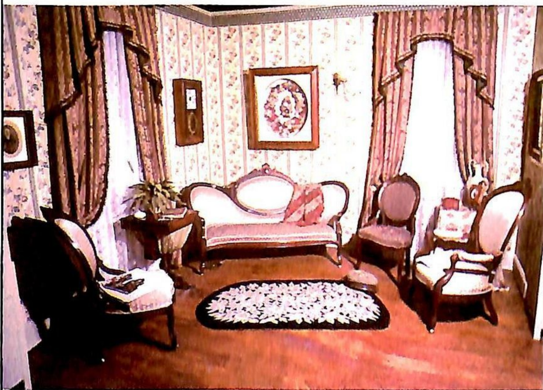
Wellington Square Parlour, Circa 1867

Also featured is an exhibit describing the golden years of agriculture when Burlington was commonly referred to as "the garden of Canada".