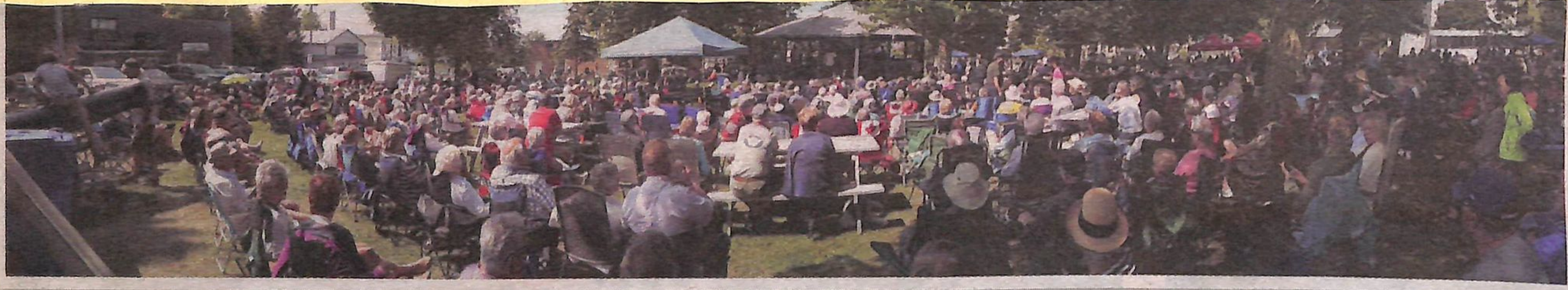
Victoria Park Kincardine hosted the 27th Annual Gathering of the Bands Festival and it went on from noon to midnight. The Toronto All Star Big Band kicked off the day, with pipe bands from Teeswater, Goderich, Wiarton, Sarnia, Forest Cambridge, the Ontario Fire Services and more entertaining, with the Mass Band Parade at 8pm on Aug. 26, 2017. There were ine ups for all-you-can-eat corn on the cob and hot dogs for a nominal fee, as visitors entered Victoria Park with a free admission to celebrate one of Kincardine's favourite traditions as a thank you from the Kincardine Scottish Pipe Band.