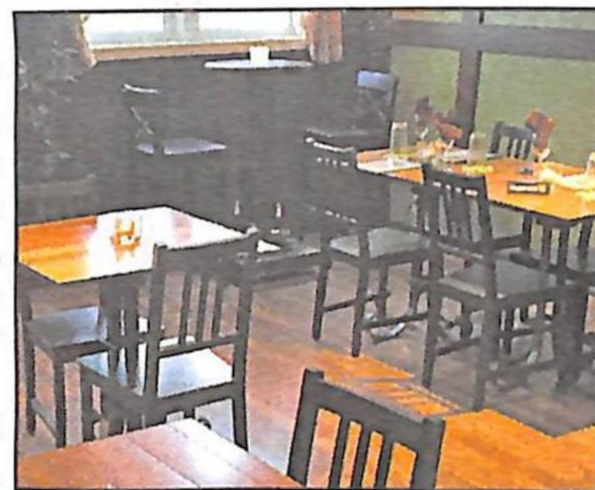
Enjoy the ambience of the newly renovated Bean's Bistro - and dinner too!

Bean's Bistro on Queen Street has your table ready. Just call 519-396-4777 to reserve your chance to enjoy Kincardine's newest dining experience.*