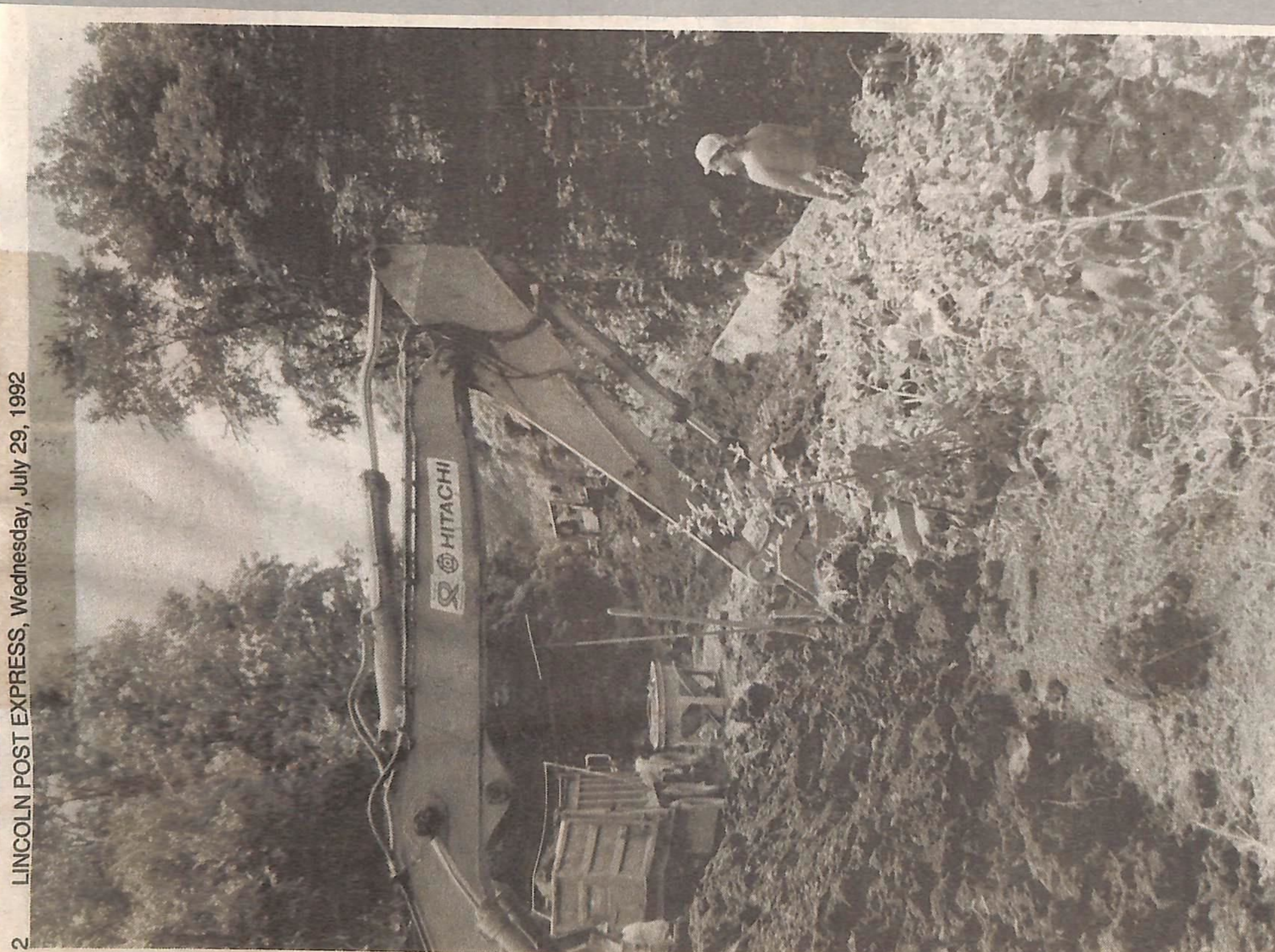
2 LINCOLN POST EXPRESS, Wednesday, July 29, 1992