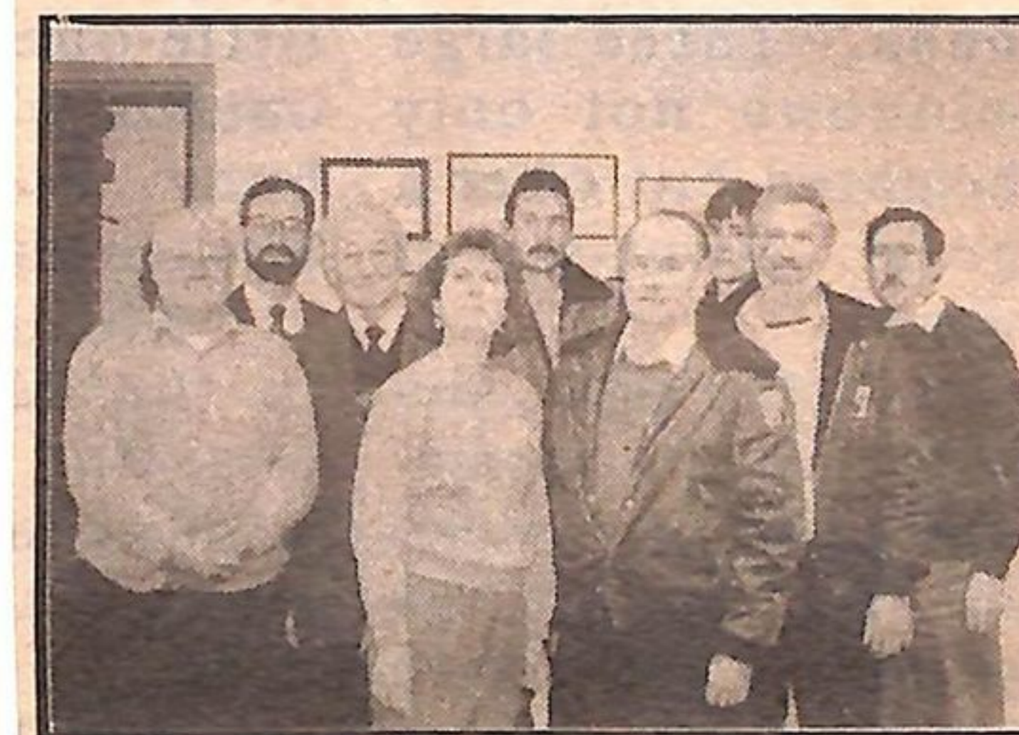
Staff, Of Bigham The Mover Ltd.