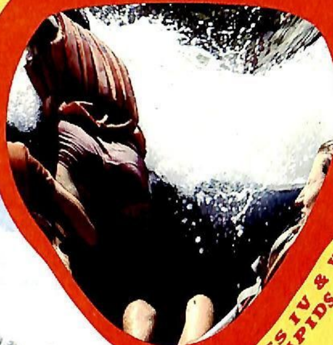
CLASS IV & V RAPIDS