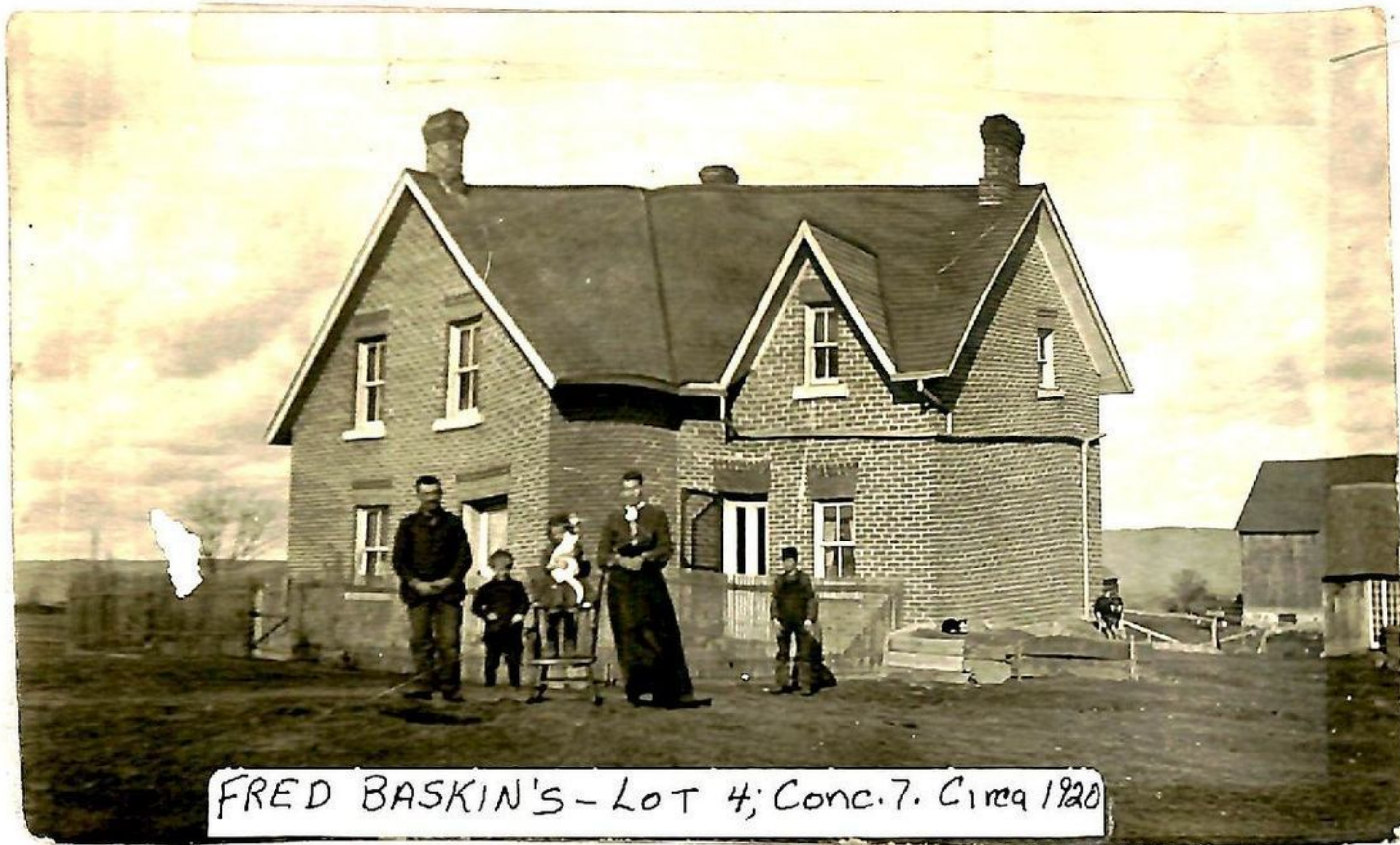
FRED BASKIN'S - Lot 4; Conc. 7. Circa 1920