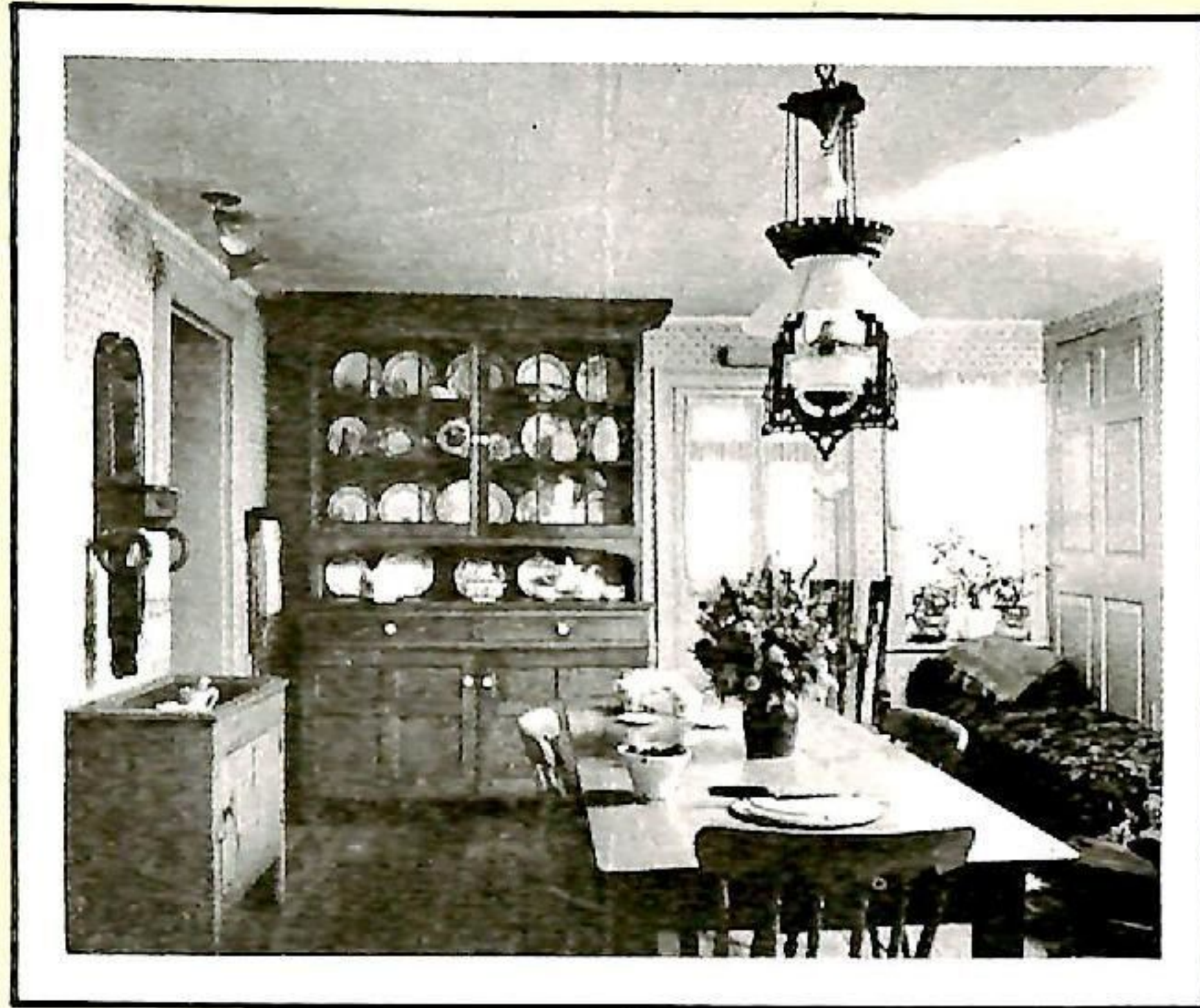
Inside view of pioneer kitchen, including original hand-hewn pine cupboard.