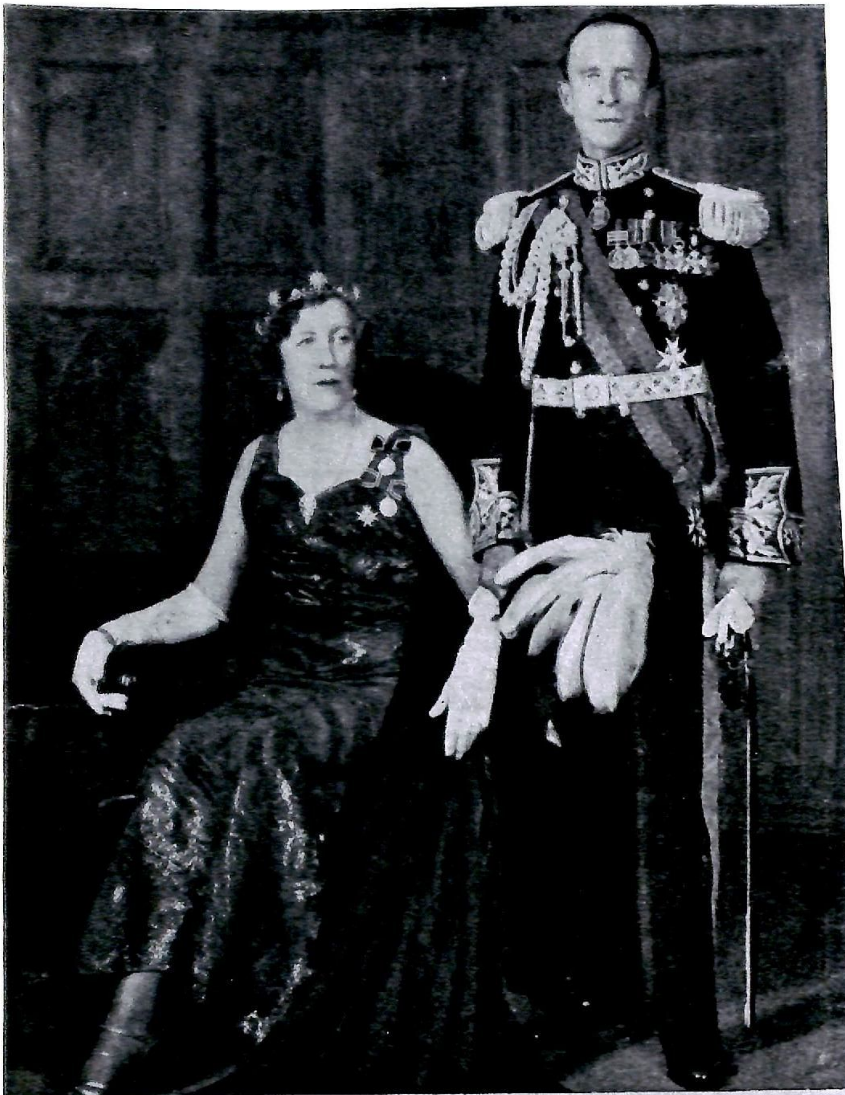
IN ROBES OF STATE , Lord and Lady Tweedsmuir sat for this official photograph prior to participating in the pageantry associated with an opening of the Canadian House of Commons by his excellency

"I am so glad to hear that the Women's Institutes are going to compile Village History Books. Events move very fast now-a-days, houses are pulled down, new roads are made, and the aspect of the country-side changes completely, sometimes in a short time.