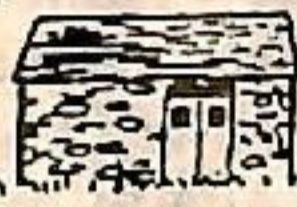
Recent Beaverton's Old Stone Jail from demolition

building on the move will come forward with a donation. Tax receipts for all donations will be forthcoming.