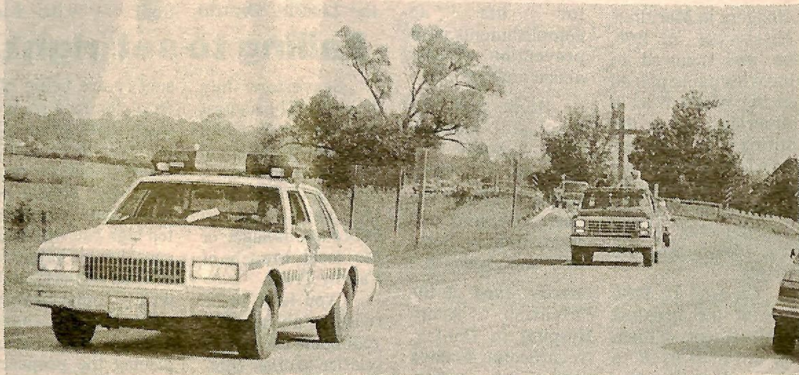
The cross was escorted into Beaverton from Orillia by police and parishioners on Friday.