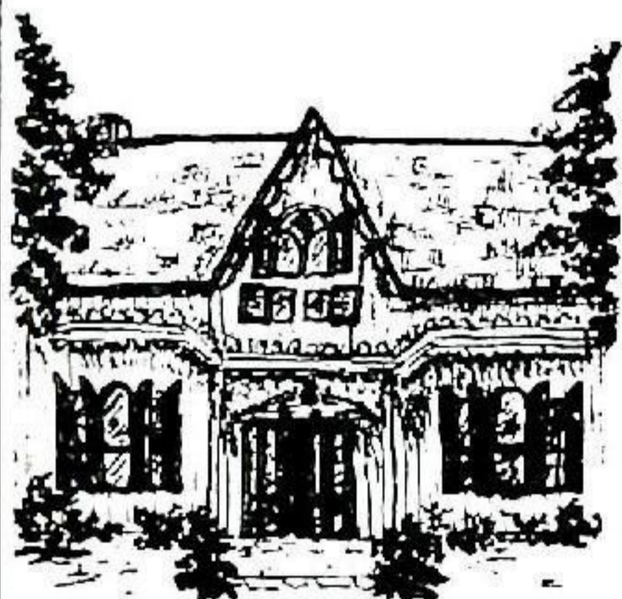
ERLAND LEE HOME (MUSEUM) STONEY CREEK