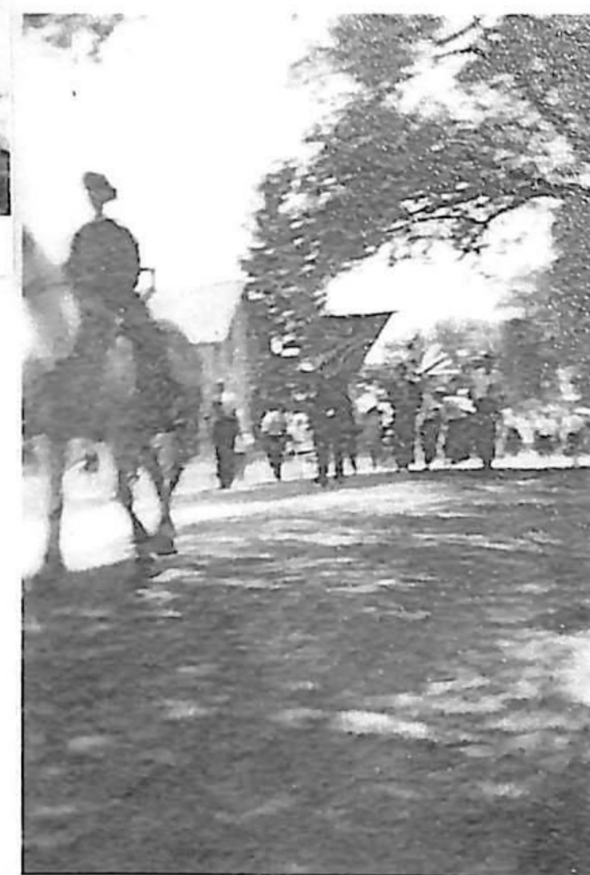
VIEWS OF DUNCHURCH ORANGE PARADES.