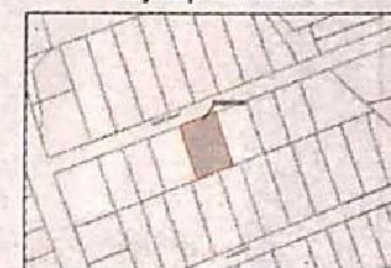
Key Map - ZBA 2017-02