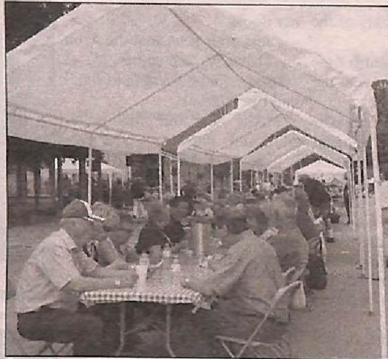
The 11th annual Warkworth Long Lunch was a sellout! Six hundred tickets were sold and the sun shone brightly making it a "picture perfect" day.

"The sun always shines down on Warkworth," said Melzack with a grin, pausing to pose for a photo in the giant outdoor picture frame.