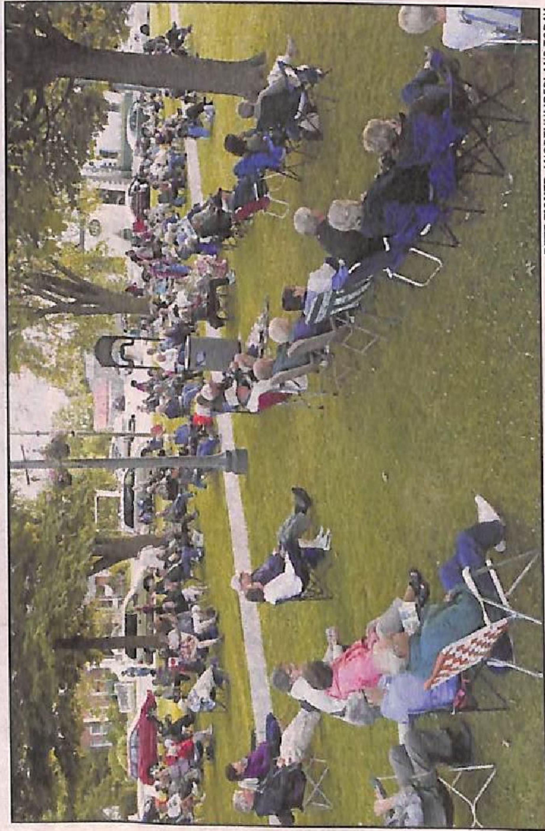
PETE FISHER / NORTHUMBERLAND TODAY