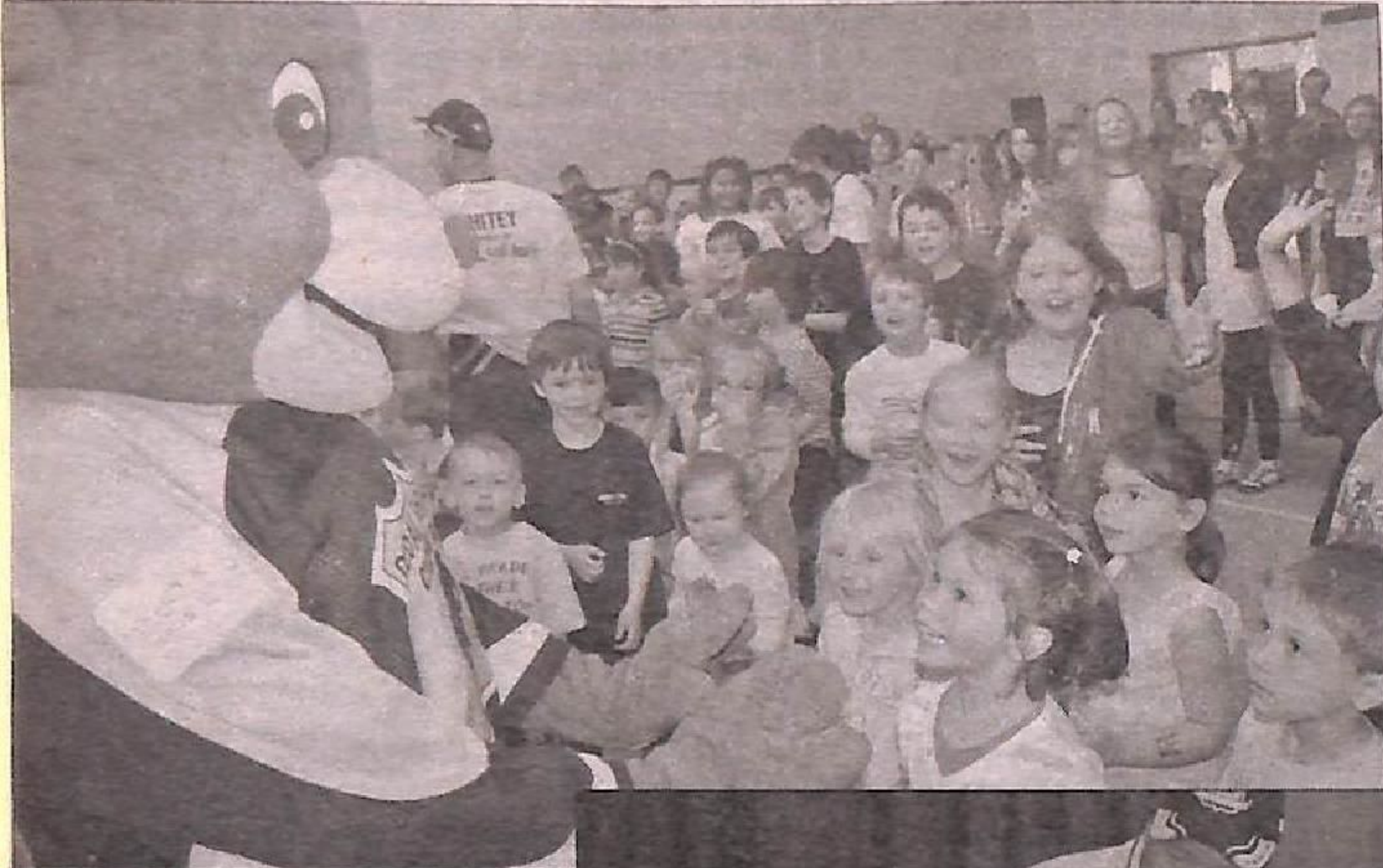
Bear, mascot for the Pedal for Hope team, mingles with the students at Colborne Public School.