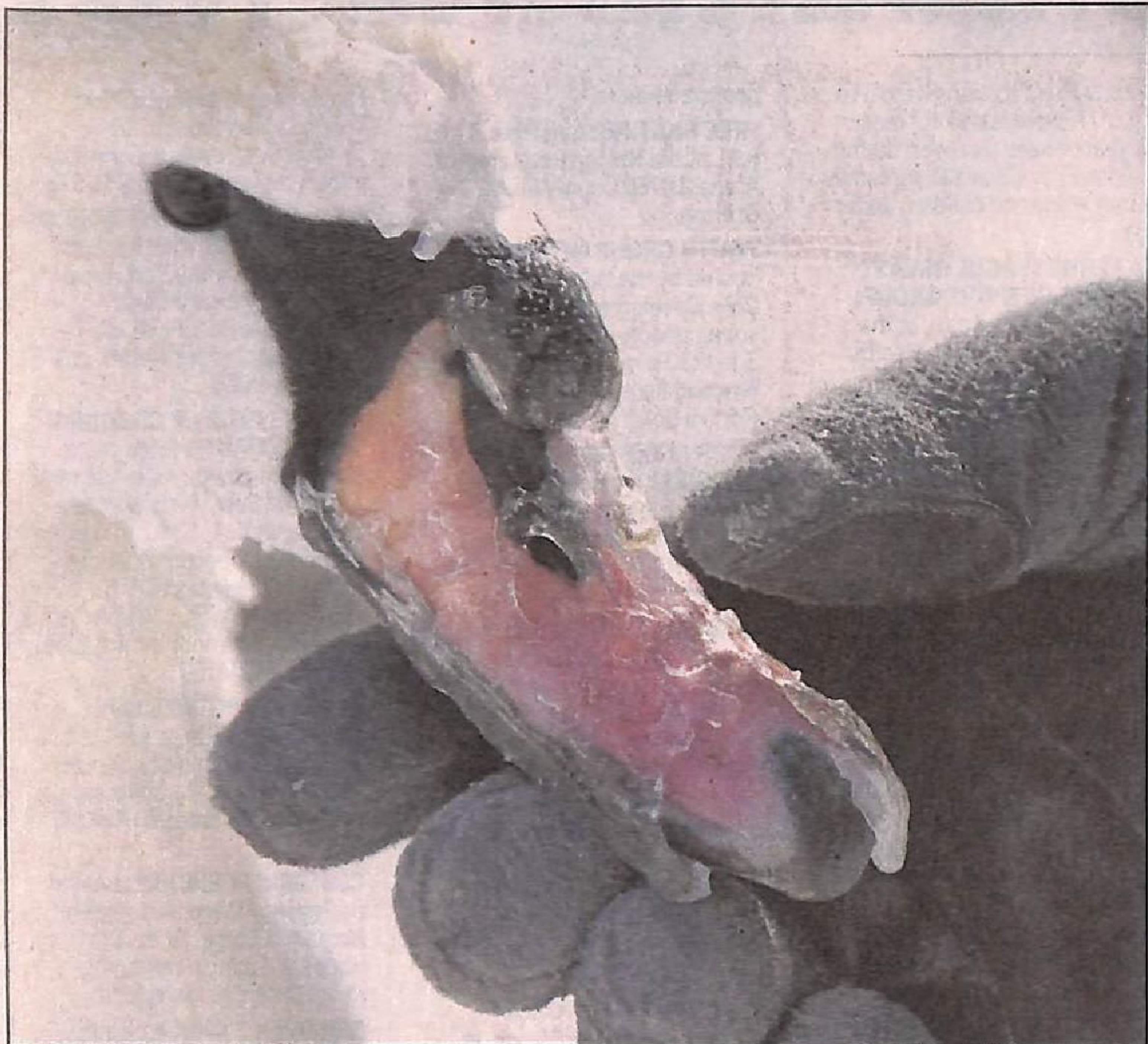
PETE FISHER /NORTHUMBERLAND TODAY