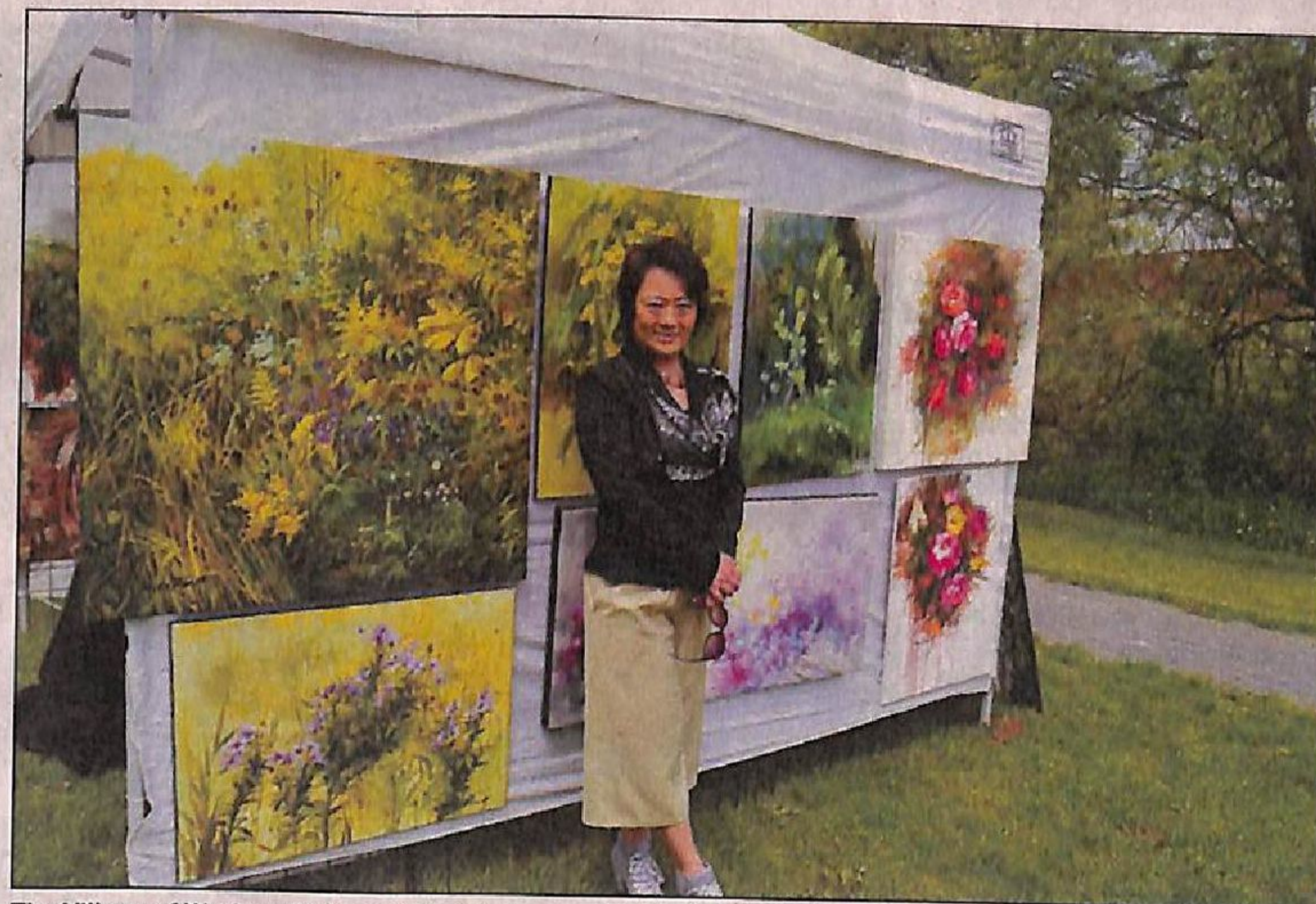
The Village of Warkworth hosted its third annual juried Art in The Park show and sale called at Mill Creek Park last weekend. There were artists from many different media who were invited to participate in the first class event which also featured musical performances, self-guided walking tours, food vendors and artists from all over Ontario showcasing and selling their work. More than 100 volunteers helped the Warkworth Business Association make the event a success.